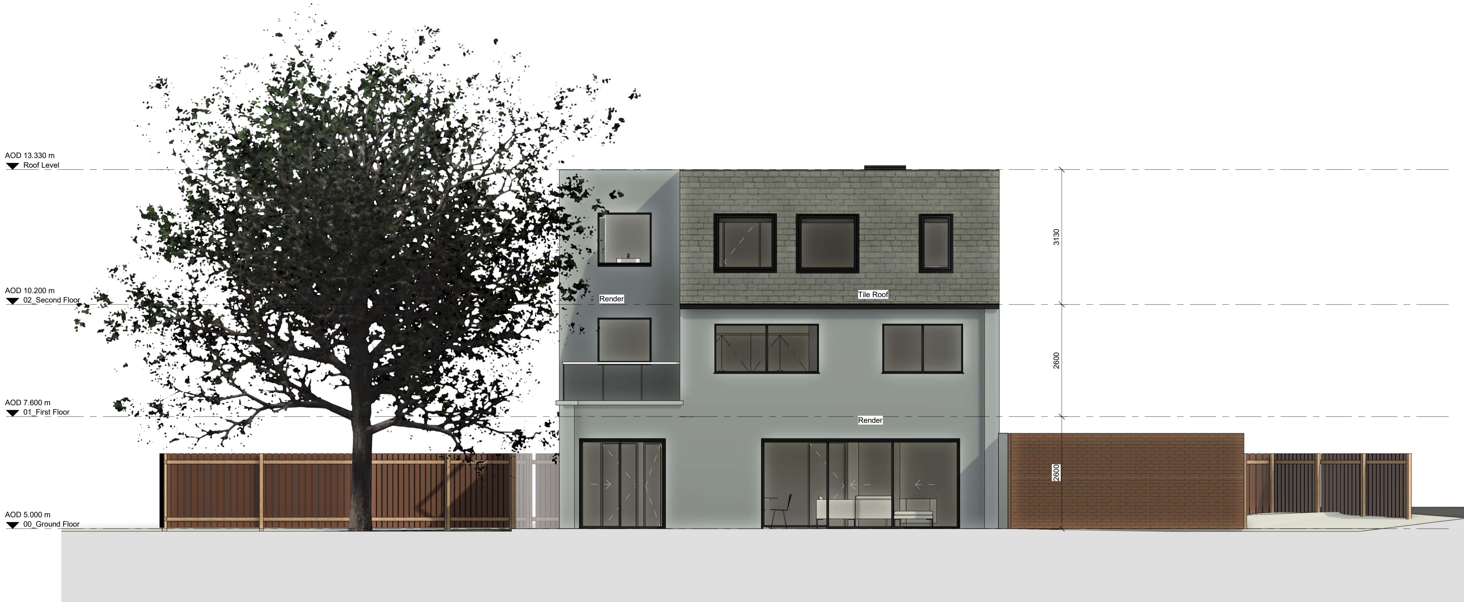
1 Existing South Elevation 20202 1 : 50