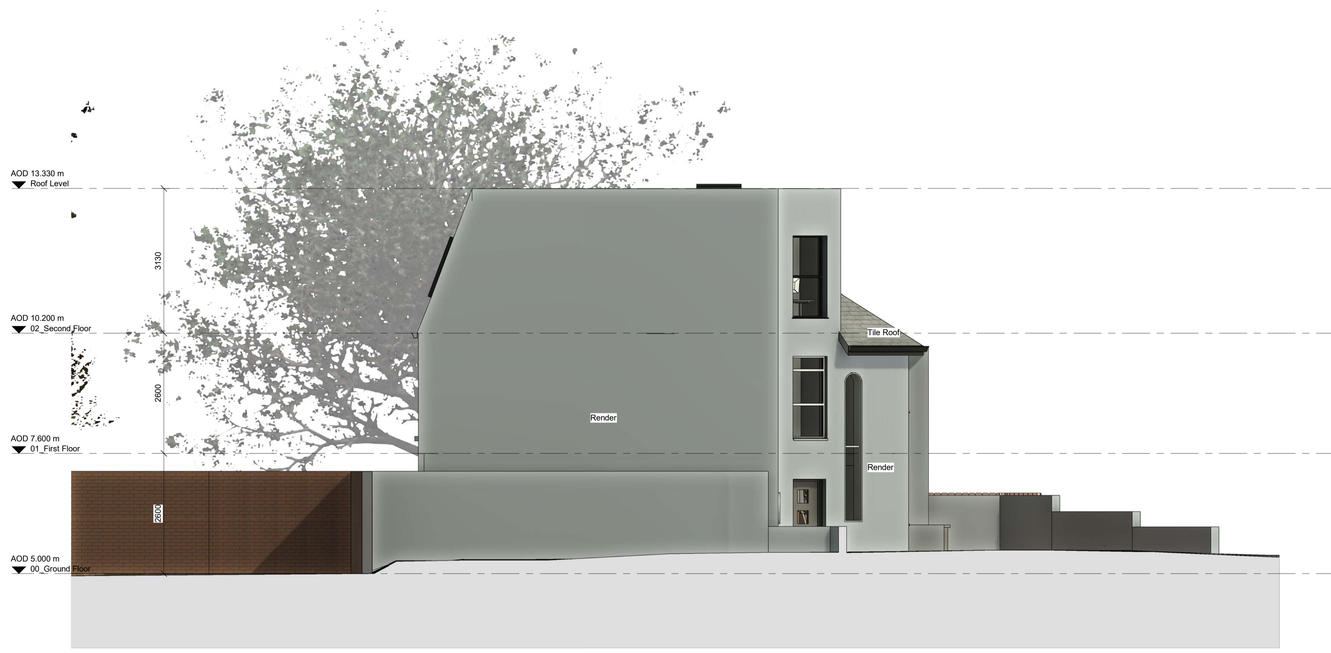
1 Existing East Elevation 20201 1 : 50

AREA MEASUREMENT The areas are approximate and can only be verified by a detailed dimensional survey of the completed building. Any decisions to be made on the basis of these predictions, whether as to project viability, pre-letting, lease agreements or the like, should include due allowance for the increases and decreases inherent in the design development and building processes. Figures relate to the likely areas of the building at the current state of the design and using the Gross External Area (GEA) / Gross Internal Area (GIA) / Net Internal Area (NIA) method of measurement from the Code of Measuring Practice, 6th Edition (RICS Code of Practice). All areas are subject to Town Planning and Conservation Area Consent, and detailed Rights to Light analysis.