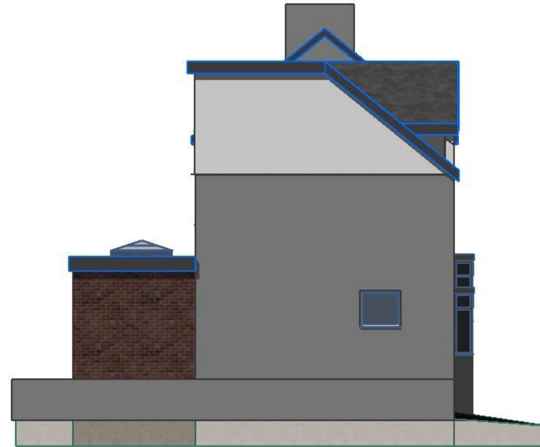
3D West Elevation