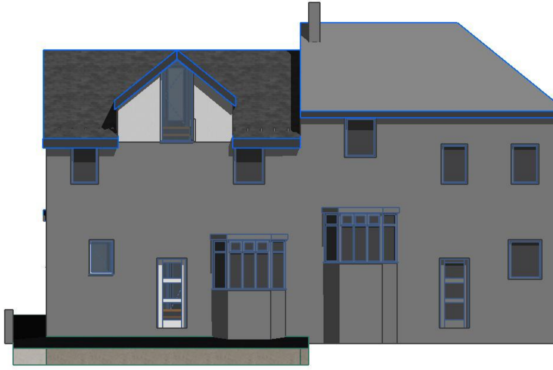
3D SOUTH ELEVATION