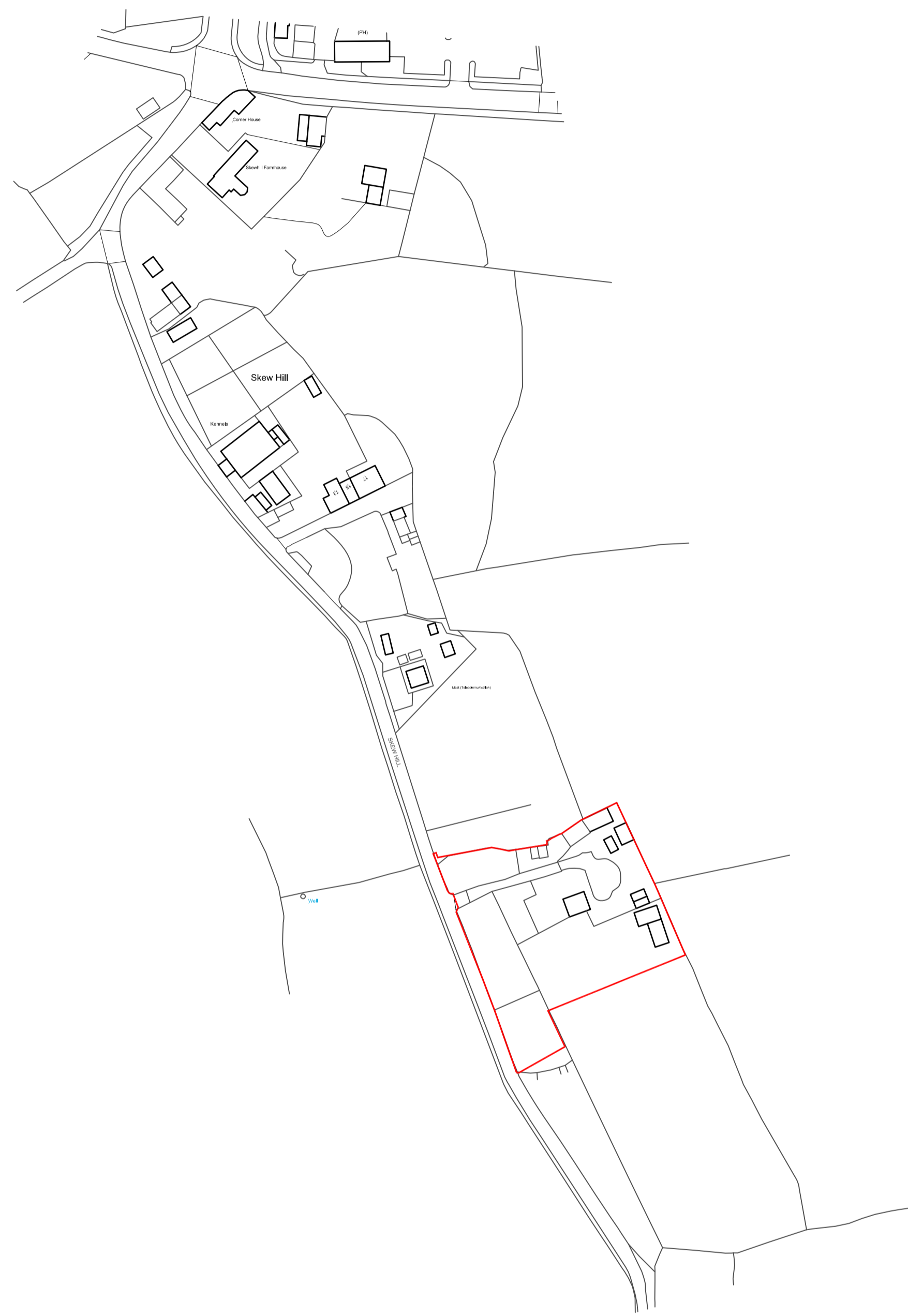
Site Plan 1:1250

THIS DRAWING IS NOT TO BE USED FOR CONSTRUCTION PURPOSES. DRAINAGE DETAILS SUBJECT TO DETAIL DESIGN & SITE INVESTIGATION. RED LINE DENOTES APPLICATION BOUNDARY, SITE OWNERSHIP SUBJECT TO CONFIRMATION BY OTHERS EXISTING INFORMATION PROVIDED FROM TOPOGRAPHICAL SURVEY BY FOSSE SURVEYING LTD. DATED 13.06.2023. JOB REF NO. 2208