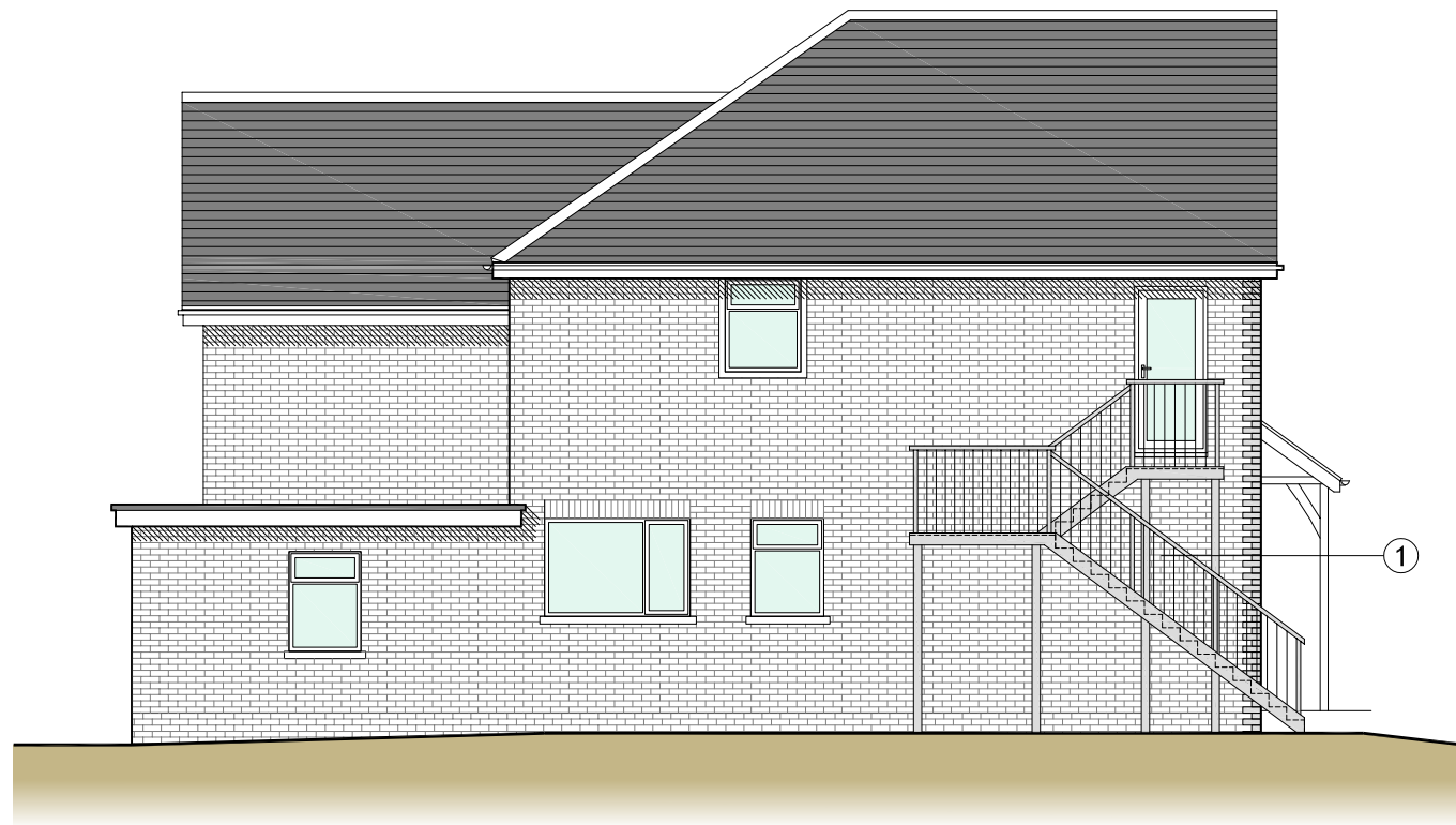
NORTH (SIDE) ELEVATION 1:100 @ A3