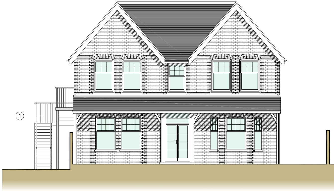
WEST (STREET) ELEVATION 1:100 @ A3

This drawing is the copyright of Elmstone Design LLP. The contractor is to check all site dimensions and levels before work starts. Do not scale from drawings. This drawing must be read with and checked against all structural and other specialist drawings, specification and bills of quantities. Notify architect of any discrepancies. The contractor is to comply with all current British Standards and Building Regulations whether or not specifically stated on these drawings.