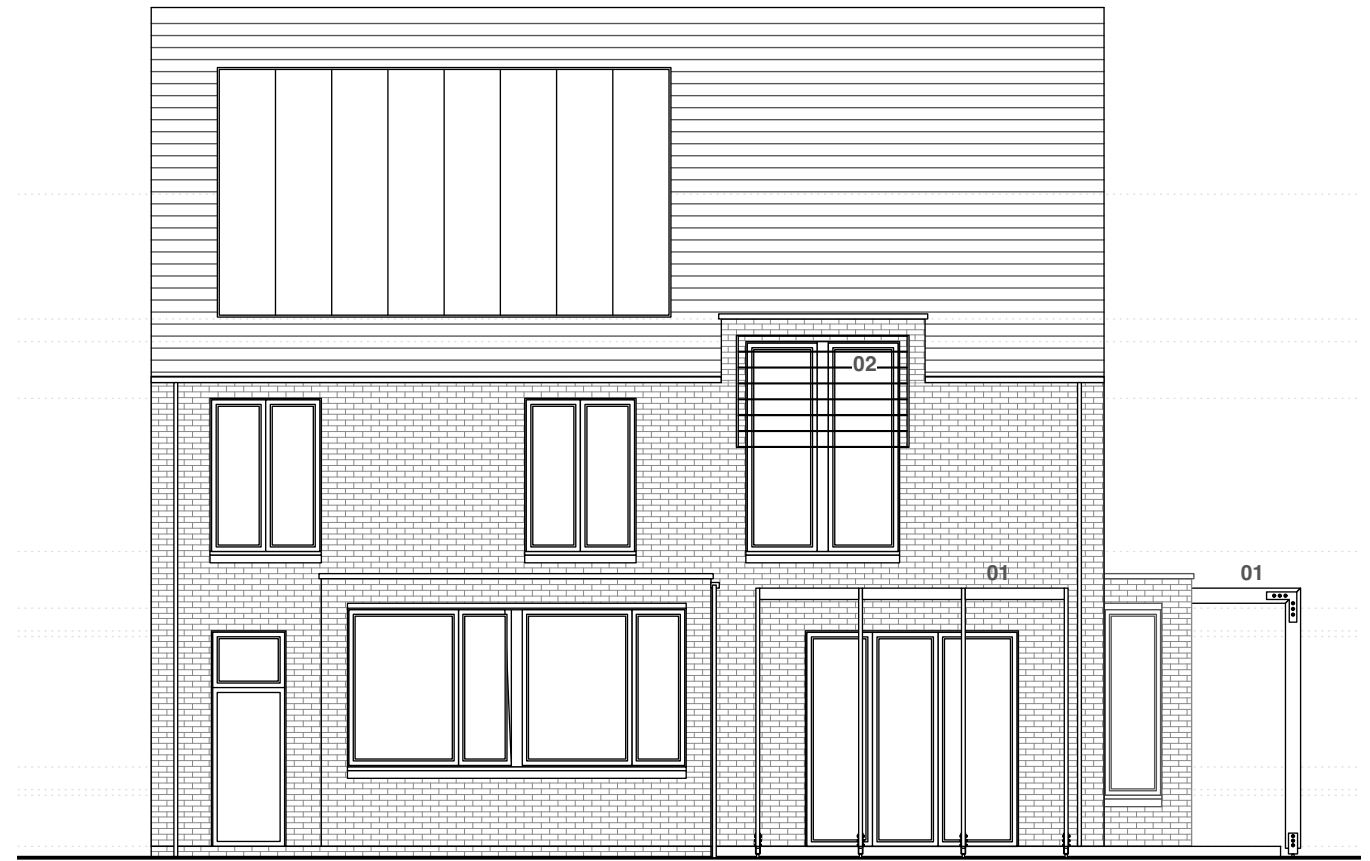
001 | proposed front / west elevation