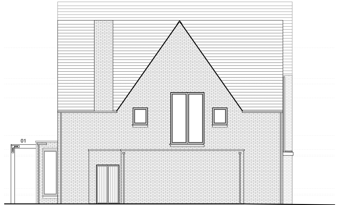
001 | proposed rear / east elevation