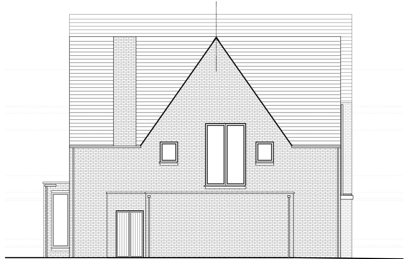
002 | existing side / north elevation