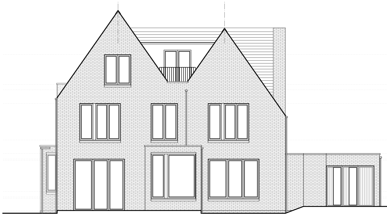
001 | existing rear / east elevation