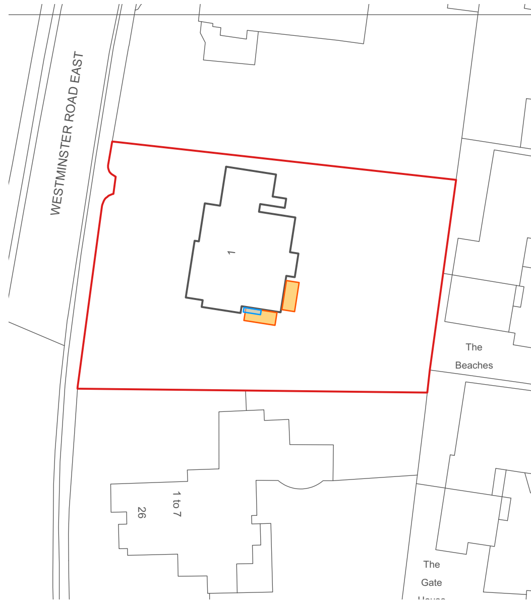
002 | site block plan | 1:500 @ A3