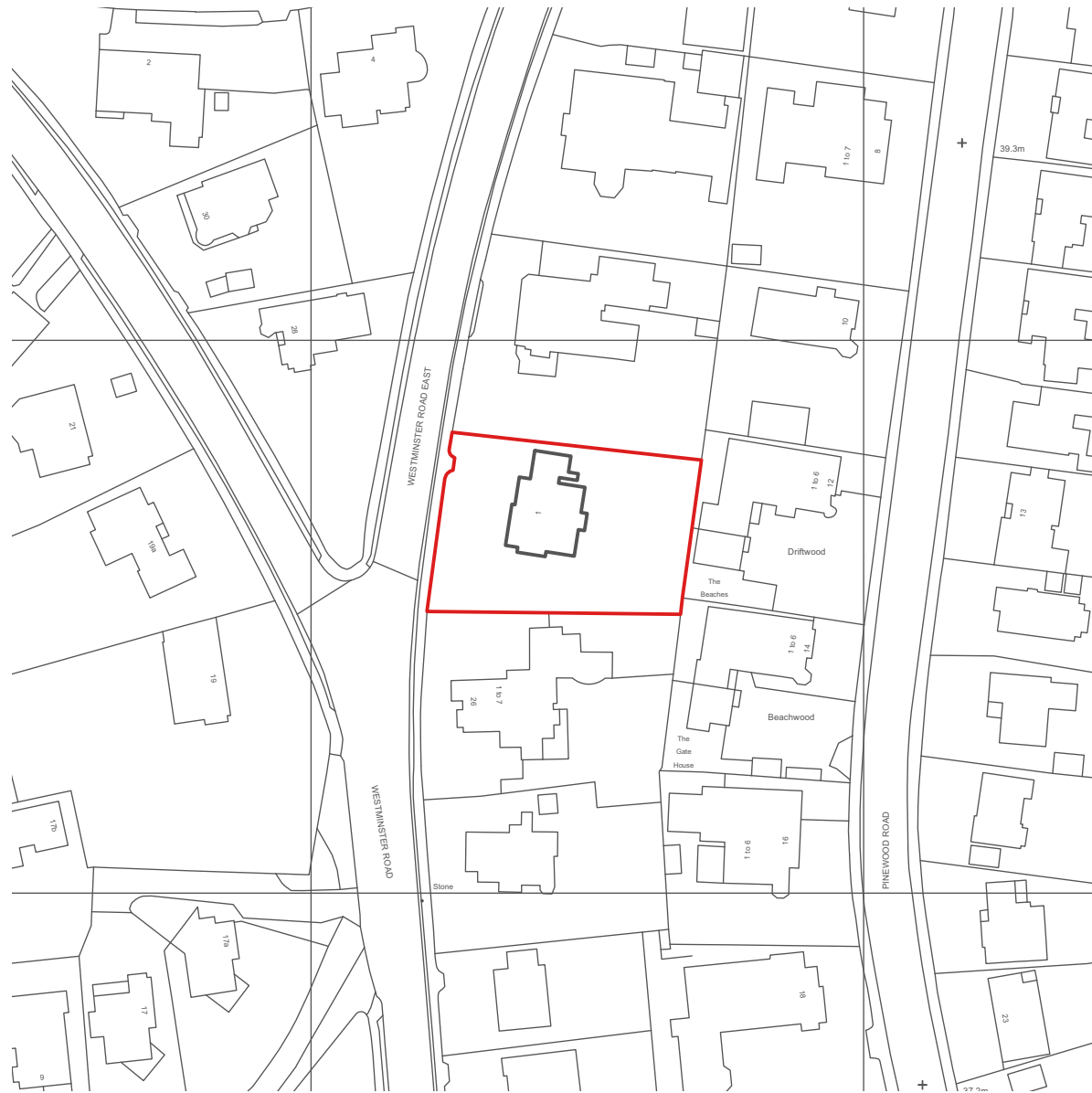
001 | site location plan | 1:1250 @ A3