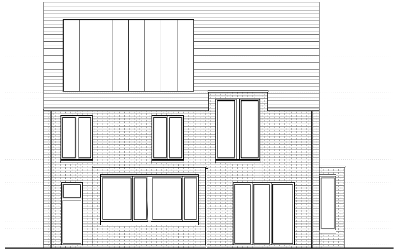
002 | existing side / south elevation