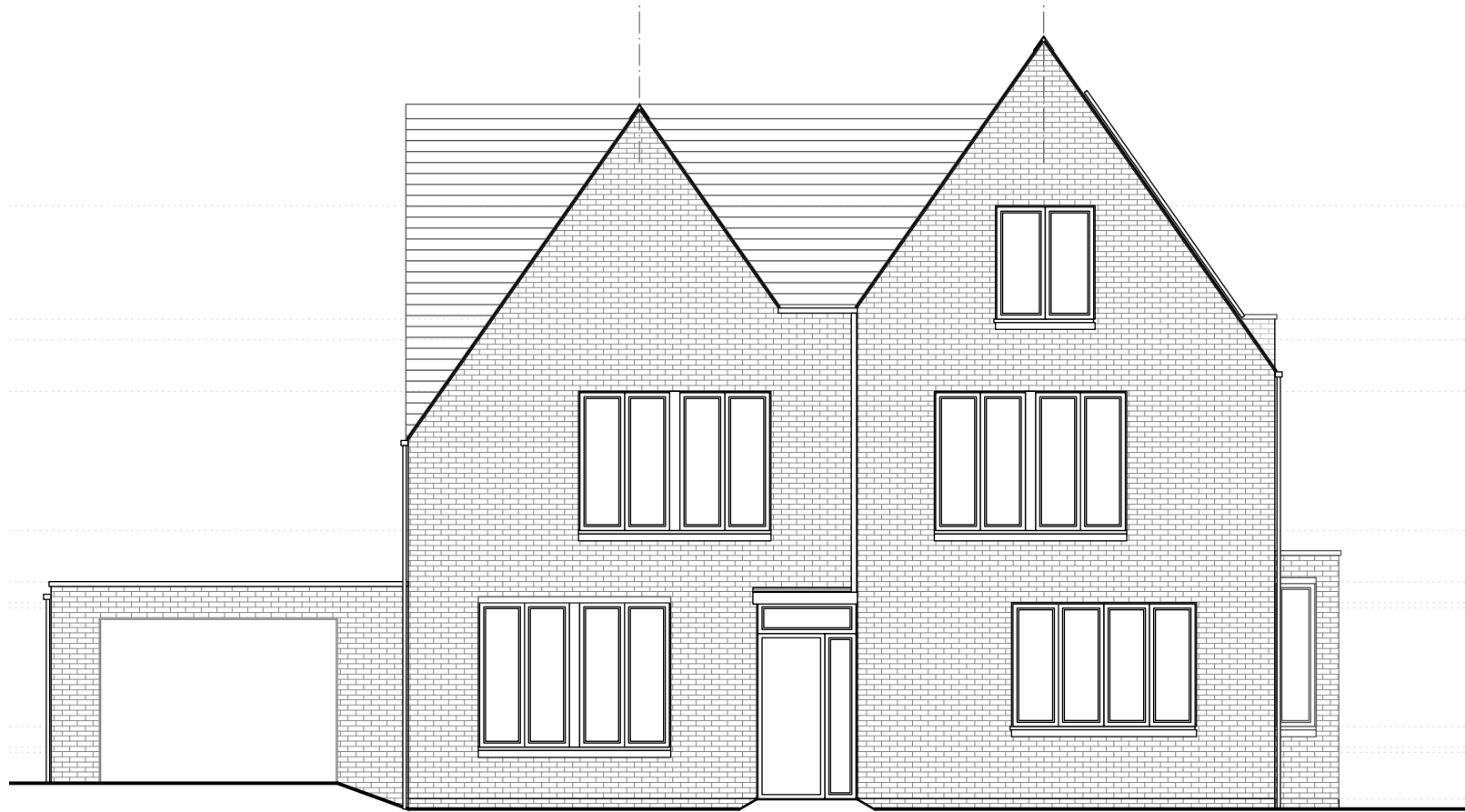
001 | existing front / west elevation