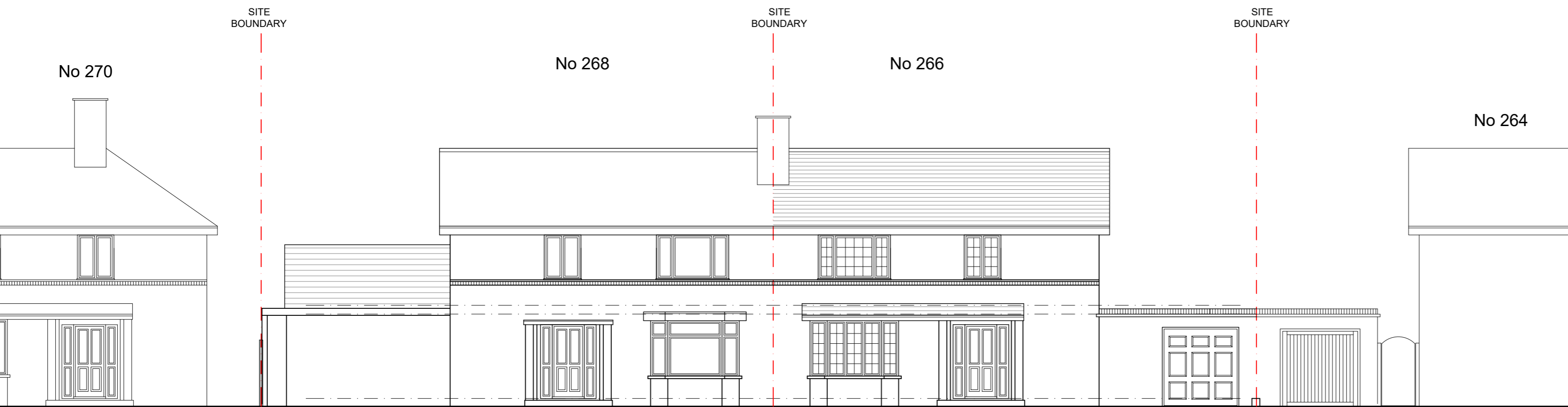
FRONT ELEVATION (SOUTH)

All dimensions are in millimetres unless noted otherwise.