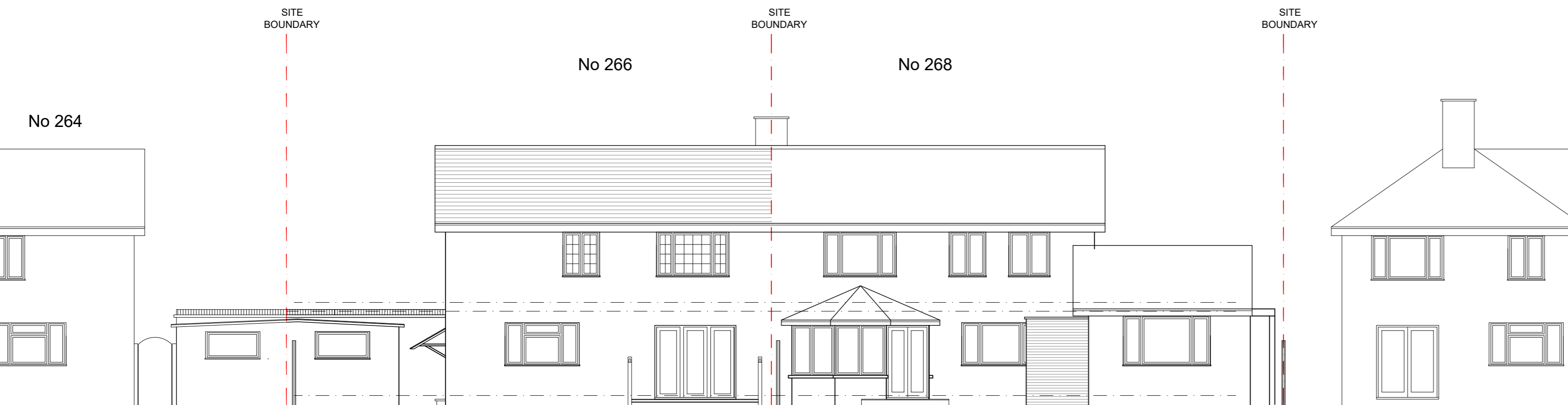
REAR ELEVATION (NORTH)