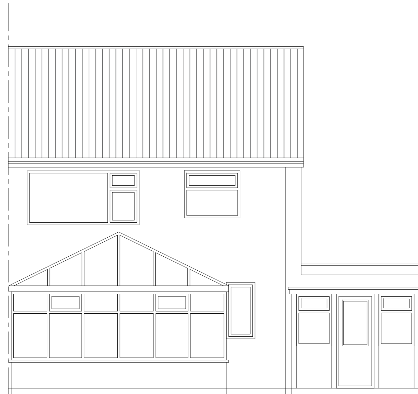
REAR ELEVATION - 1:50