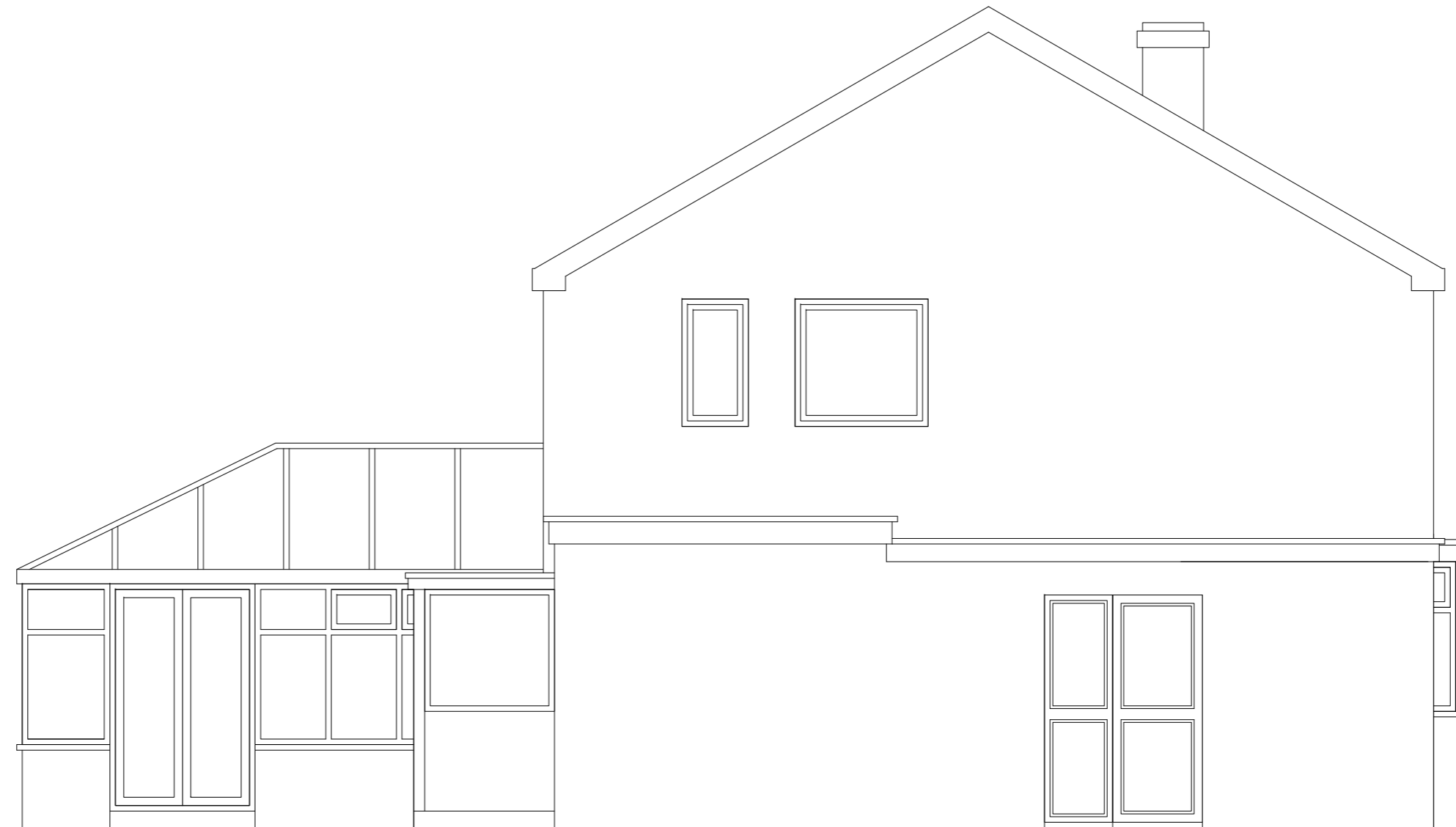
SIDE ELEVATION - 1:50