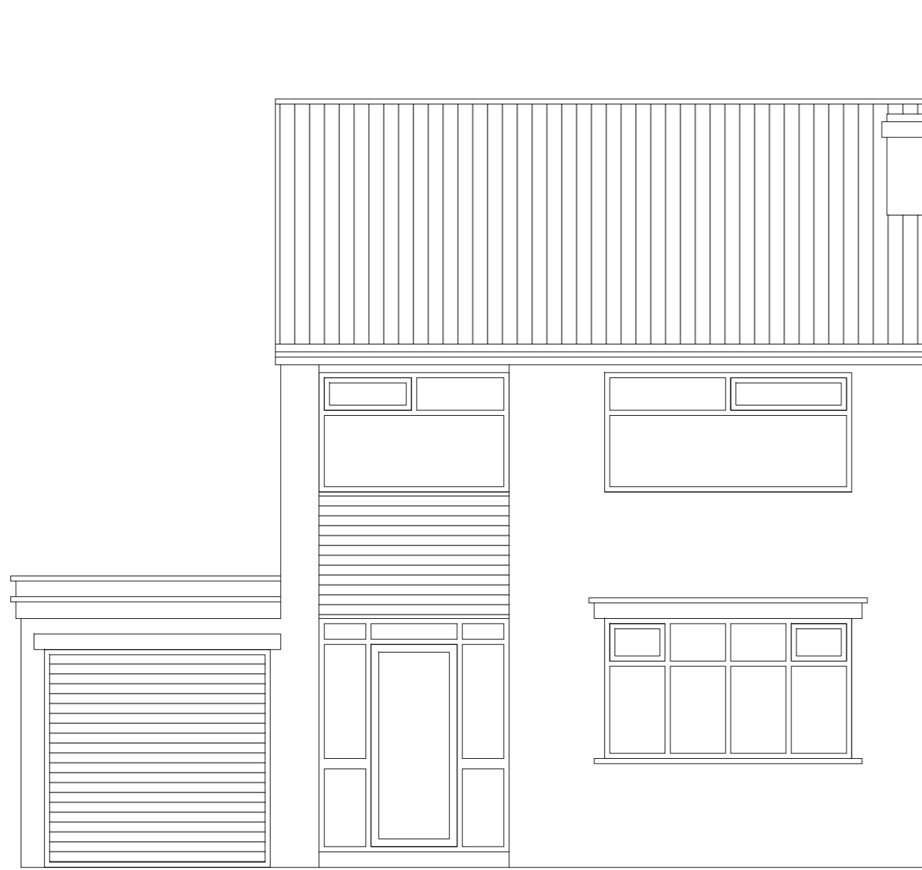
FRONT ELEVATION - 1:50