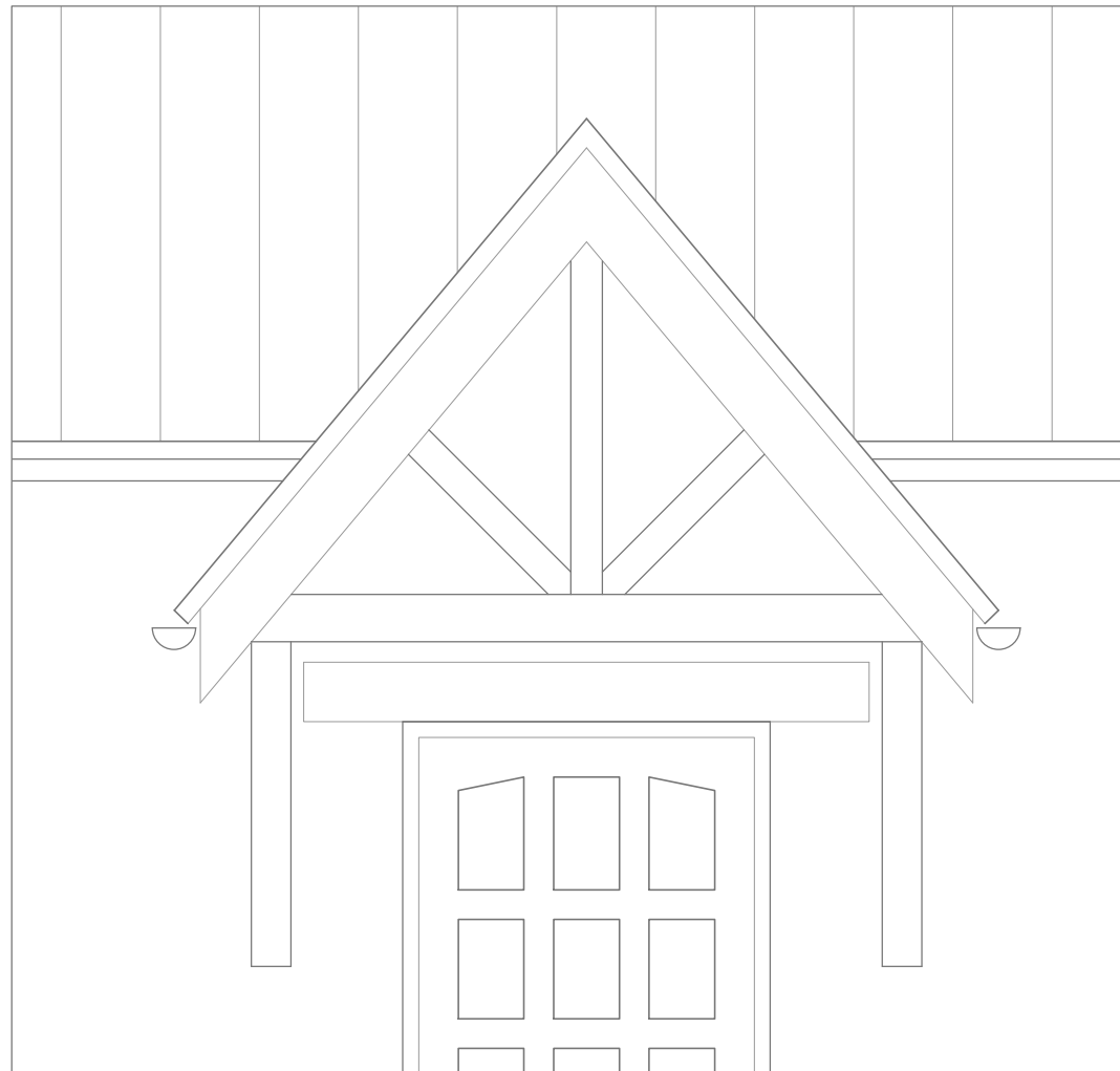
Proposed Porch (on South-West Elevation) Scale 1:20