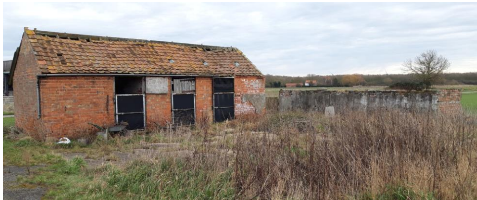
Southern elevation of barn proposed for conversion.