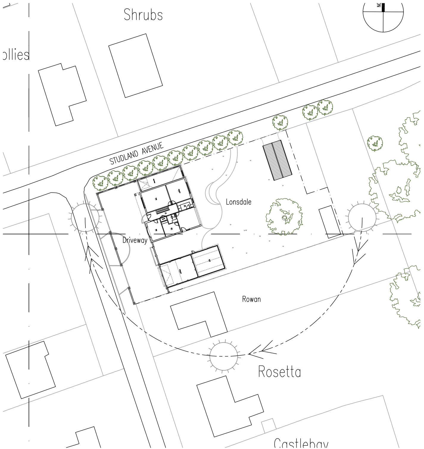
Proposed block Plan Scale 1:500

NOTE: Do not scale from this drawing. All contractors are to notify client/architect of any discrepancies of of variations relating to setting out and levels prior to manufacturing and construction of any components. To be read in conjunction with all other contract documentation.