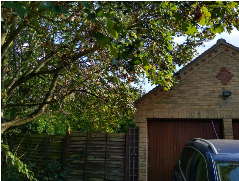
View of tree from front of garage showing encroachment.

The images below show the extent to which the tree now encroaches over the garage and covers a nearby smaller tree and hedgerow stifling its growth