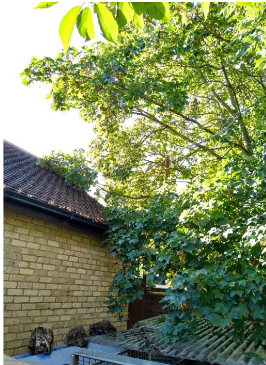
View of tree from side/rear of garage showing encroachment.