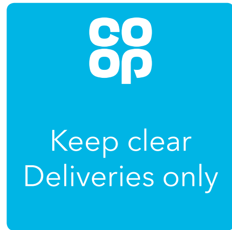
Item 4 - scale 1:10@ A3