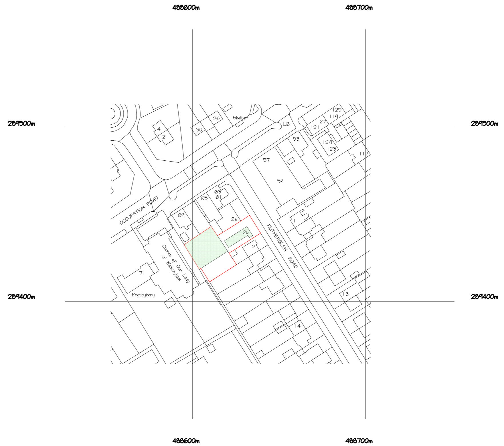
Crown Copyright and database rights 2023 OS Licence no. 100041041 LOCATION PLAN Scale 1:1250