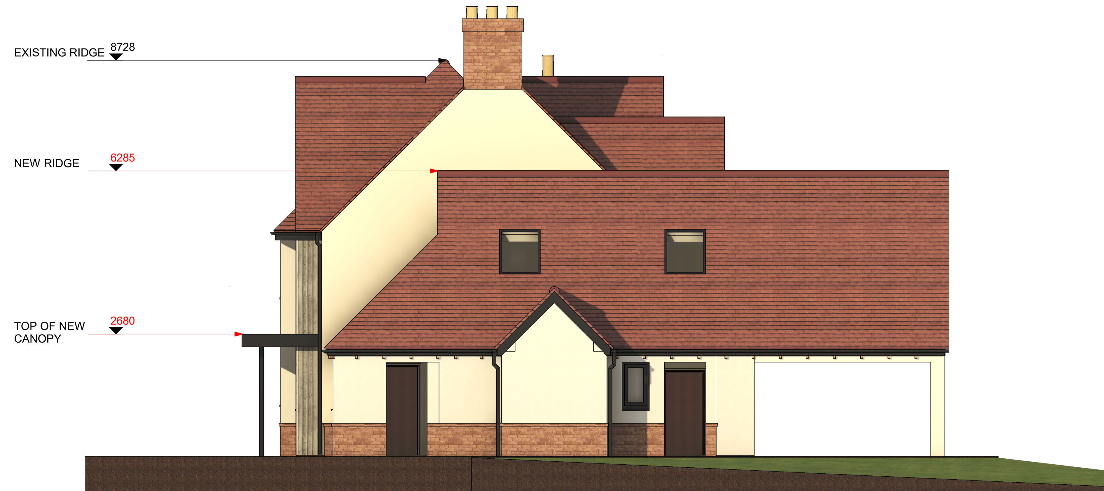
2 West Elevation GA (RIBA Stage 3) 1 : 50