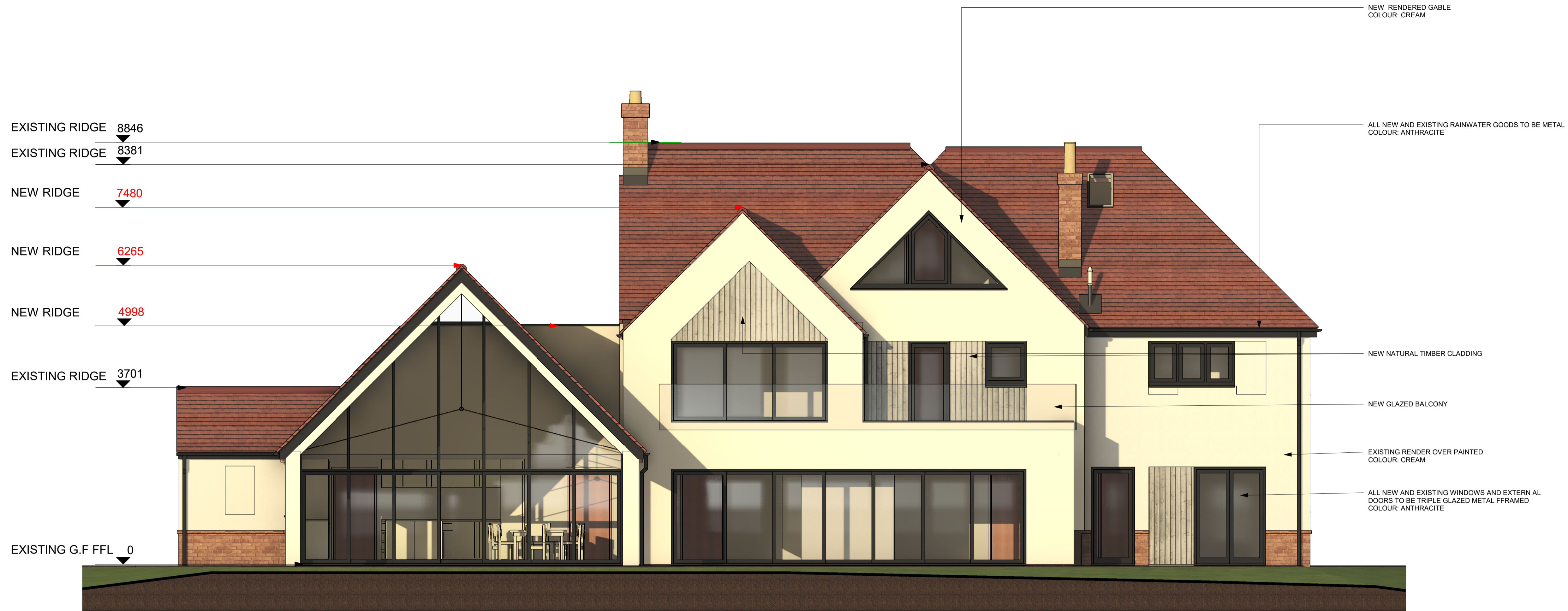
1 South Elevation GA (RIBA Stage 3) 1 : 50