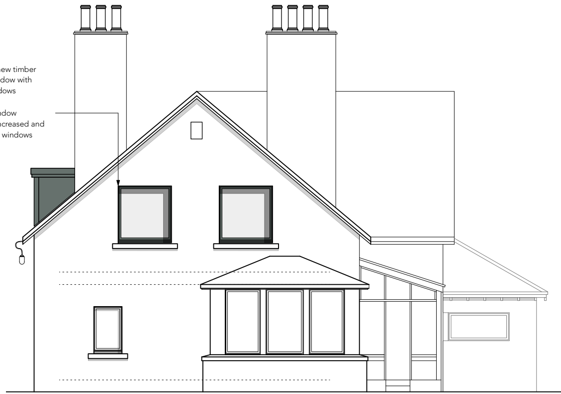
south elevation 1:100 (part elevation)