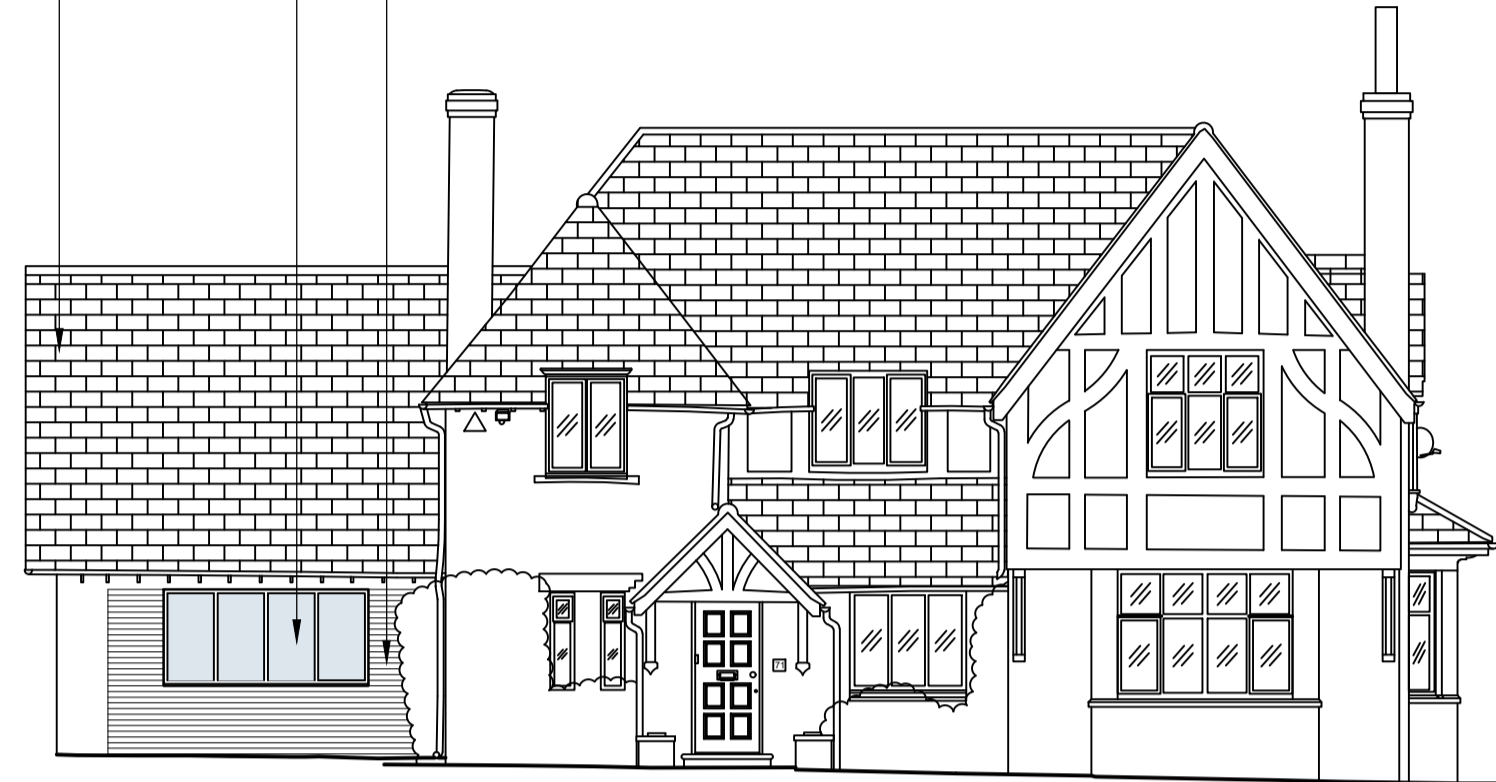
Proposed Front (South West) Elevation.

NEW PPC ALUMINIUM WINDOWS NEW RED MULTI BRICKWORK INFILL TO MATCH EXISTING