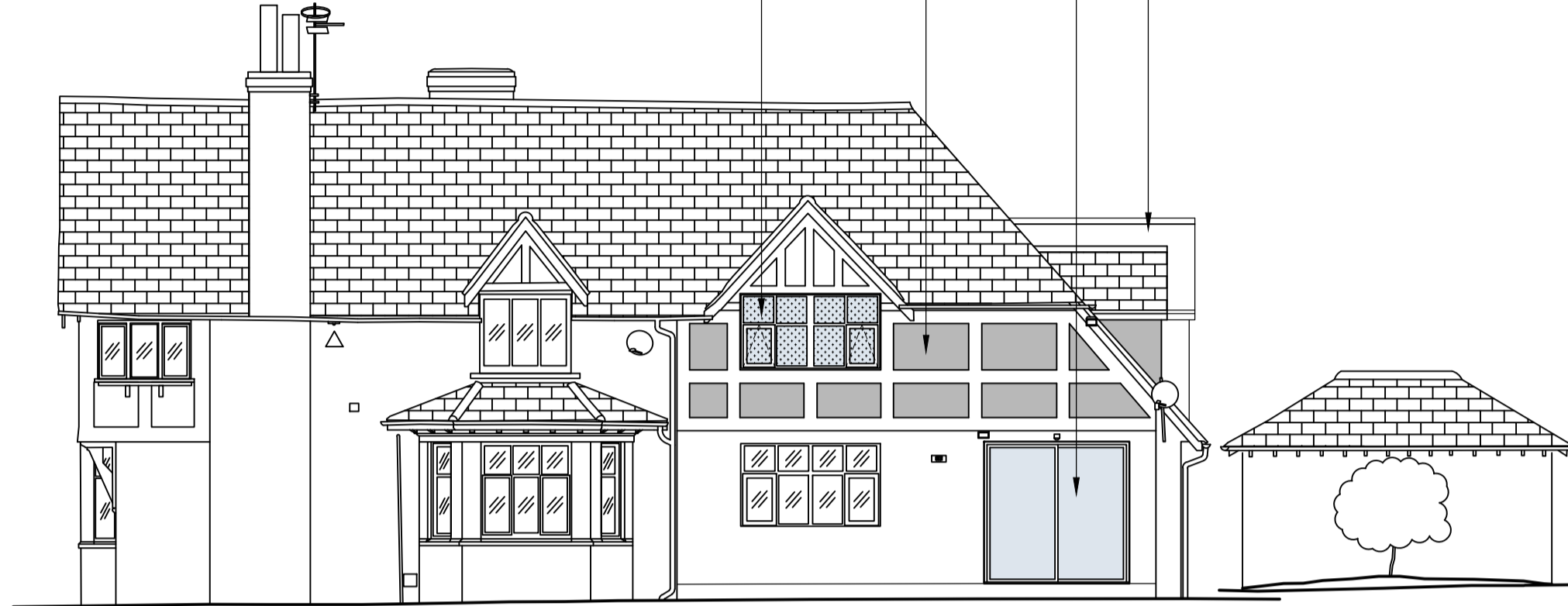
Proposed Side (South East) Elevation.

NEW LARGER DORMERS TO REPLACE EXISTING DORMERS