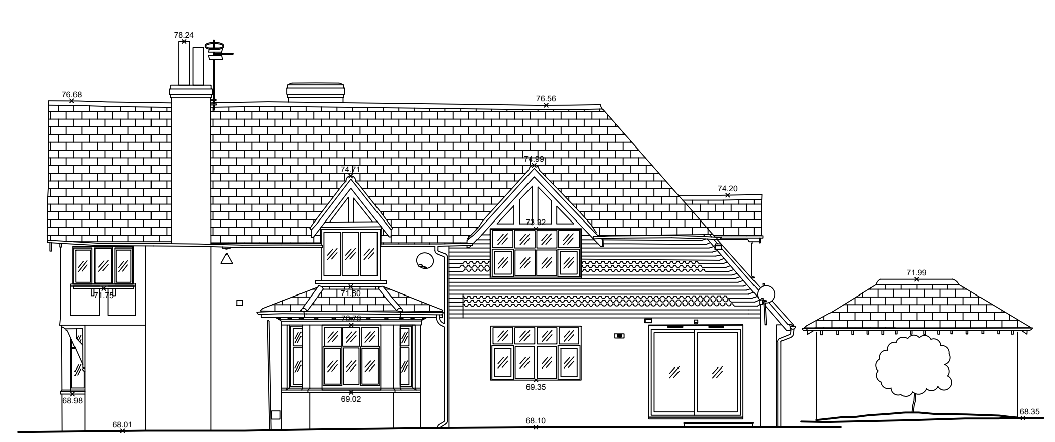
Existing Side (South East) Elevation.