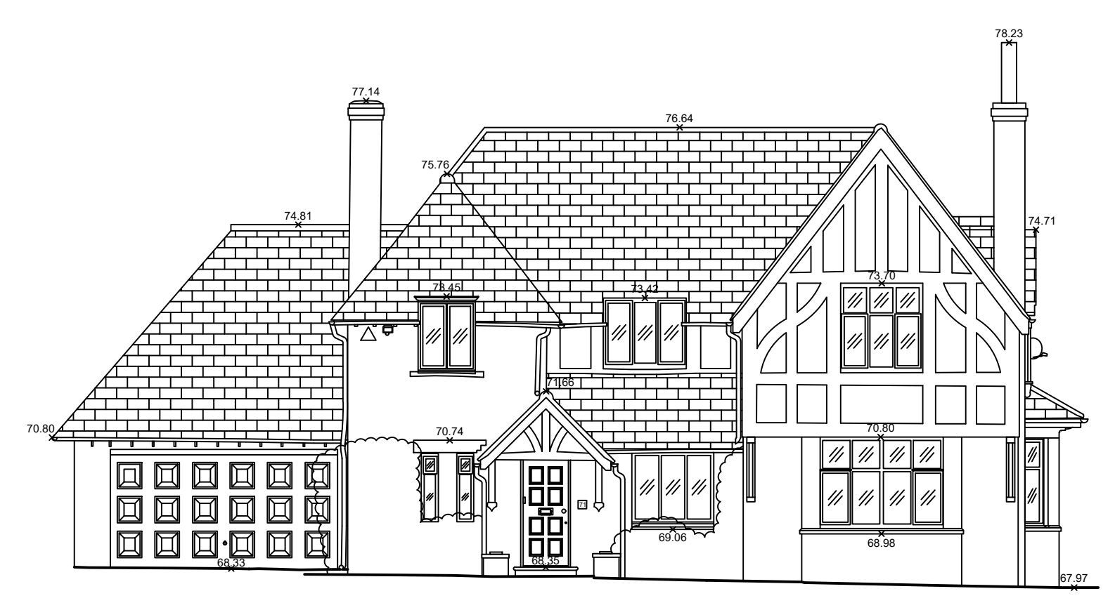
Existing Front (South West) Elevation.