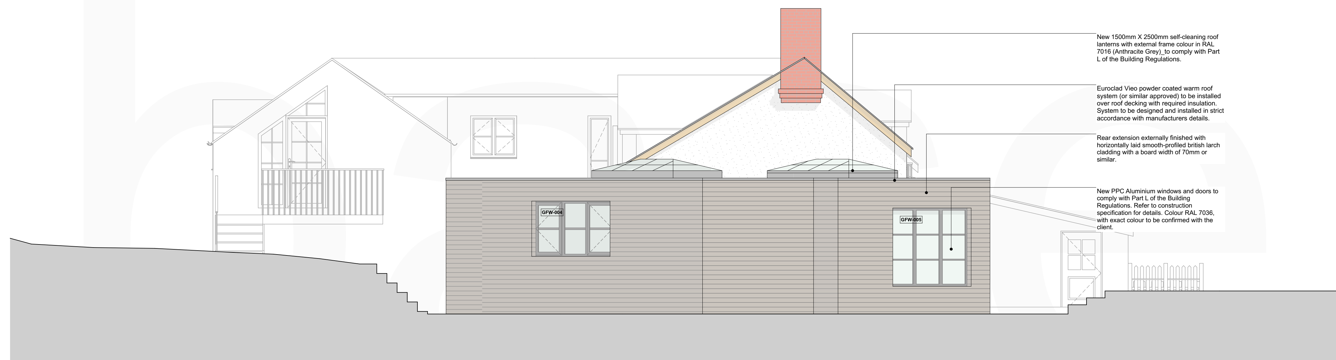
E-20_Rear Elevation 1:50