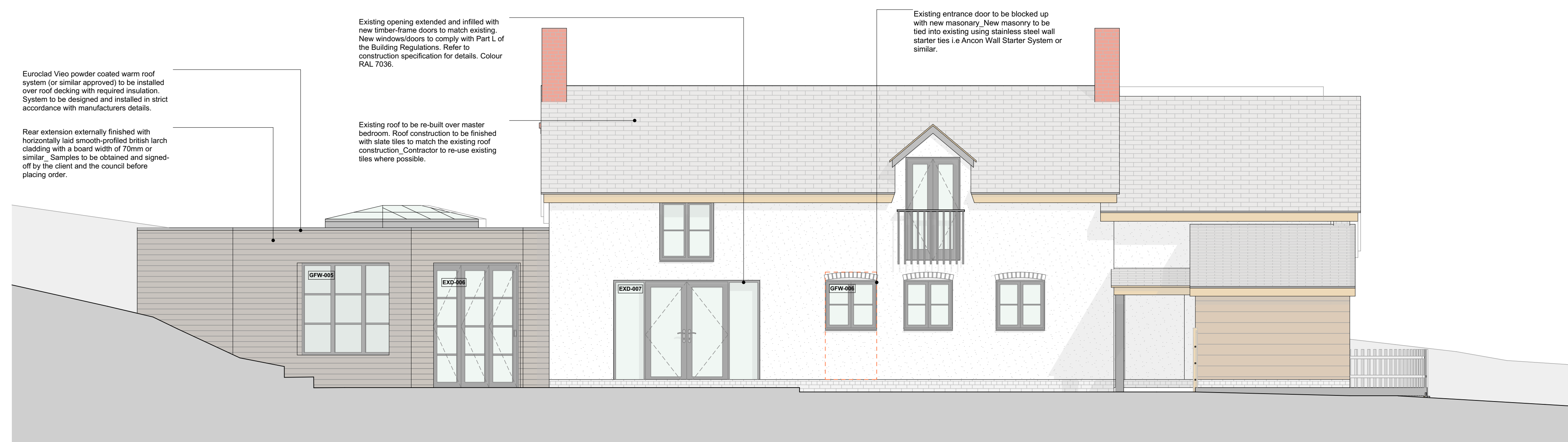
E3_Side Elevation 1:50