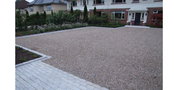
Example of Gravel Drive Finish - TBC by Client