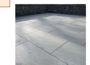
Example of Porcelain Paving Tiles - TBC by Client