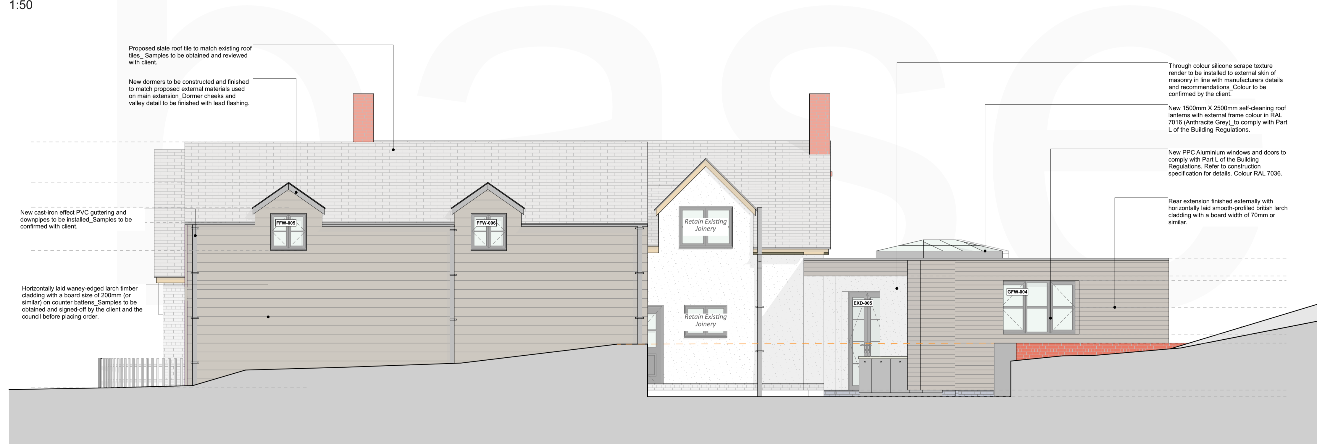
E2 Side Elevation 1:50