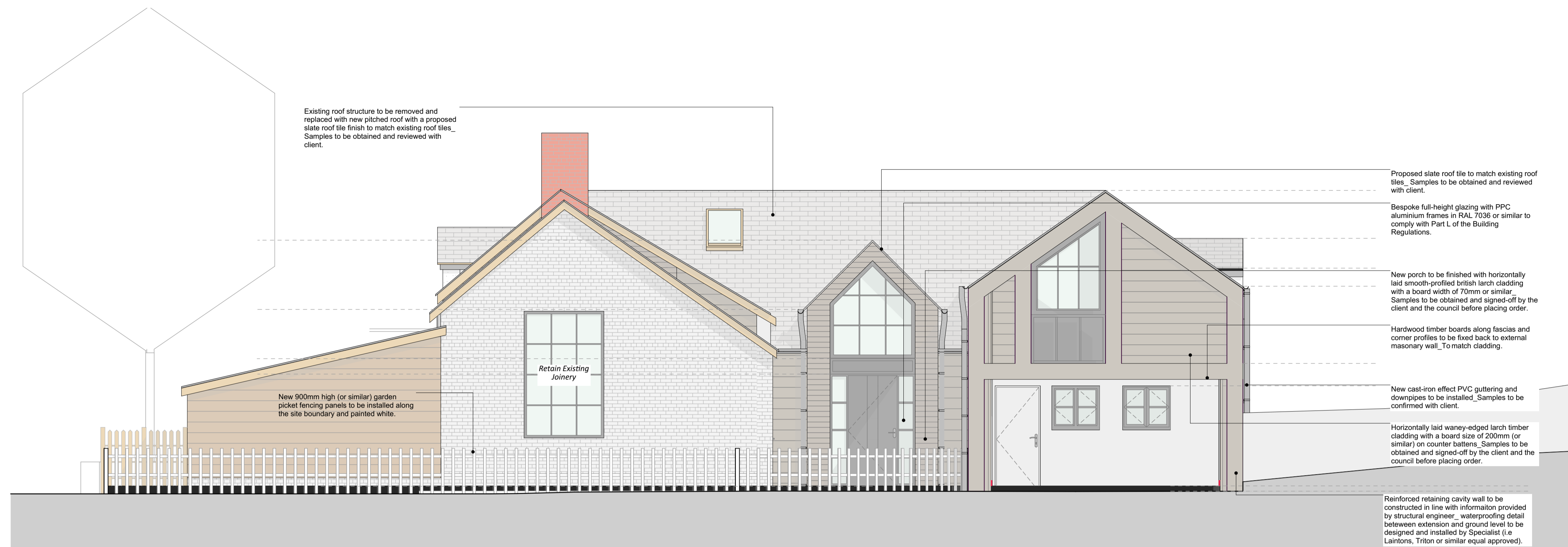
E1 Front Elevation 1:50