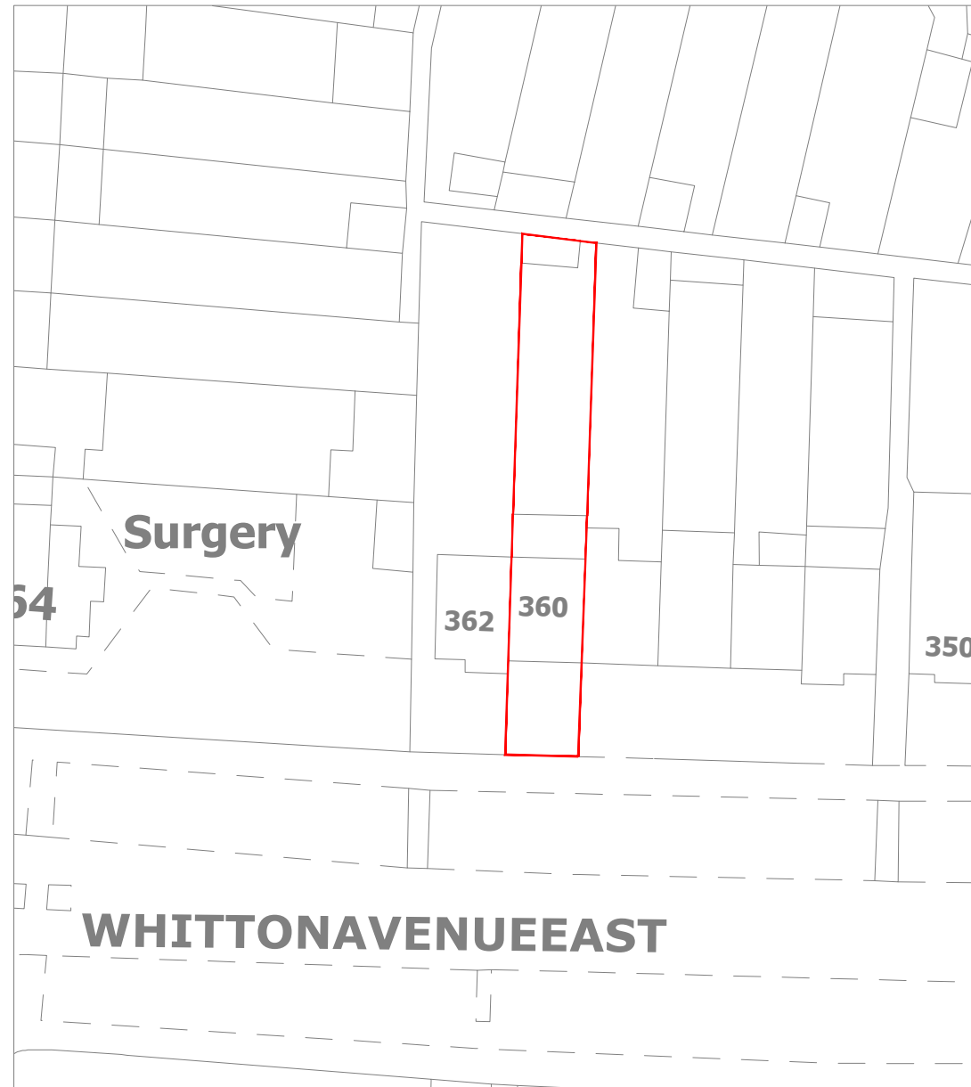
2 BLOCK PLAN Scale 1:500