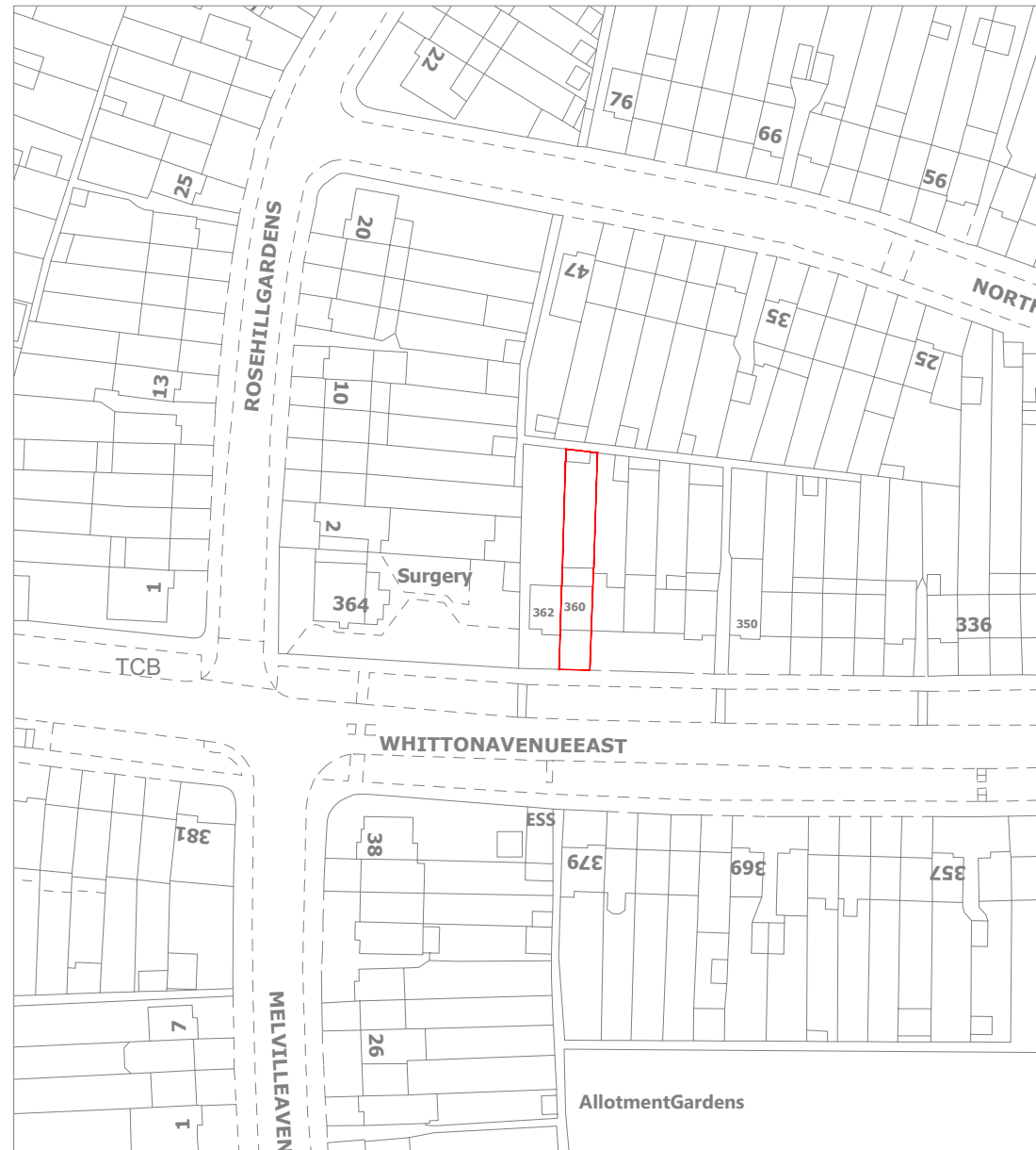
1 LOCATION PLAN Scale 1:1250

© Crown copyright and database rights 2023 Ordnance Survey (AC0000851941).