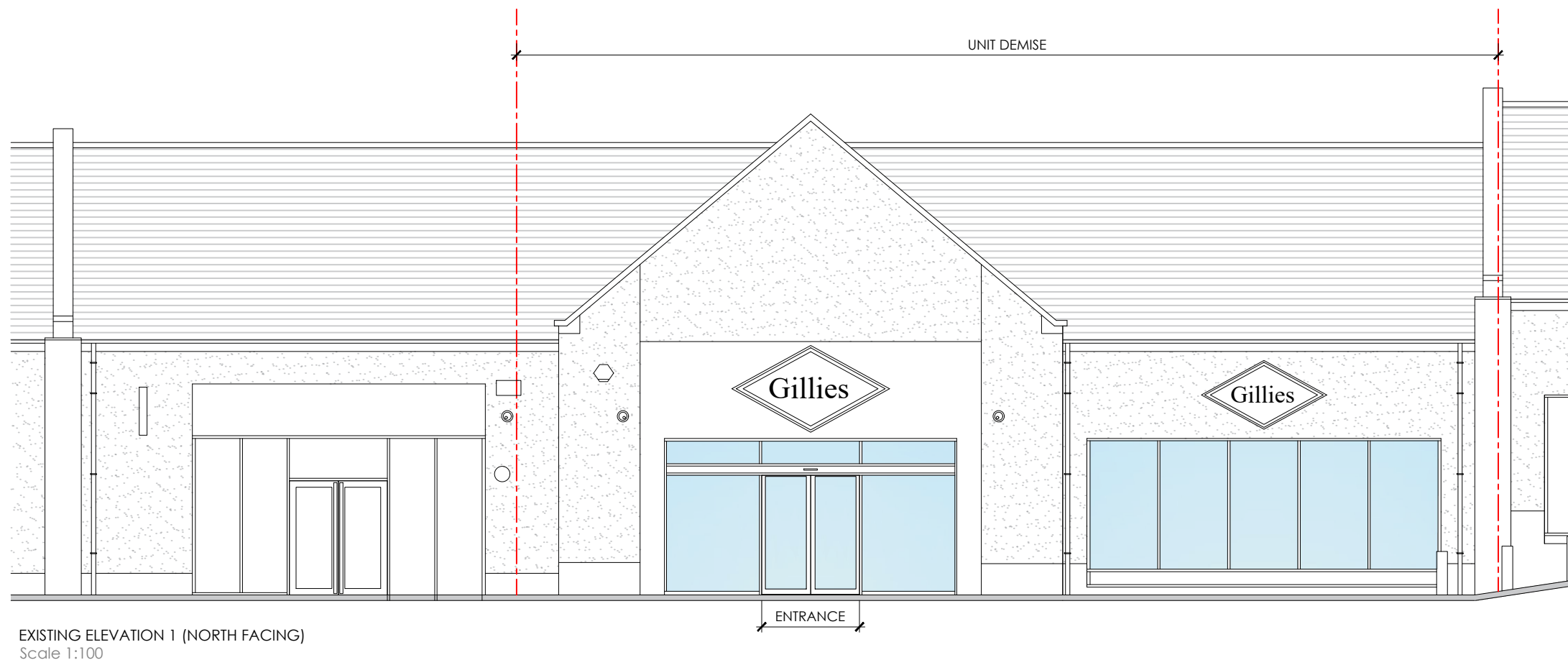
EXISTING ELEVATION 1 (NORTH FACING) Scale 1:100