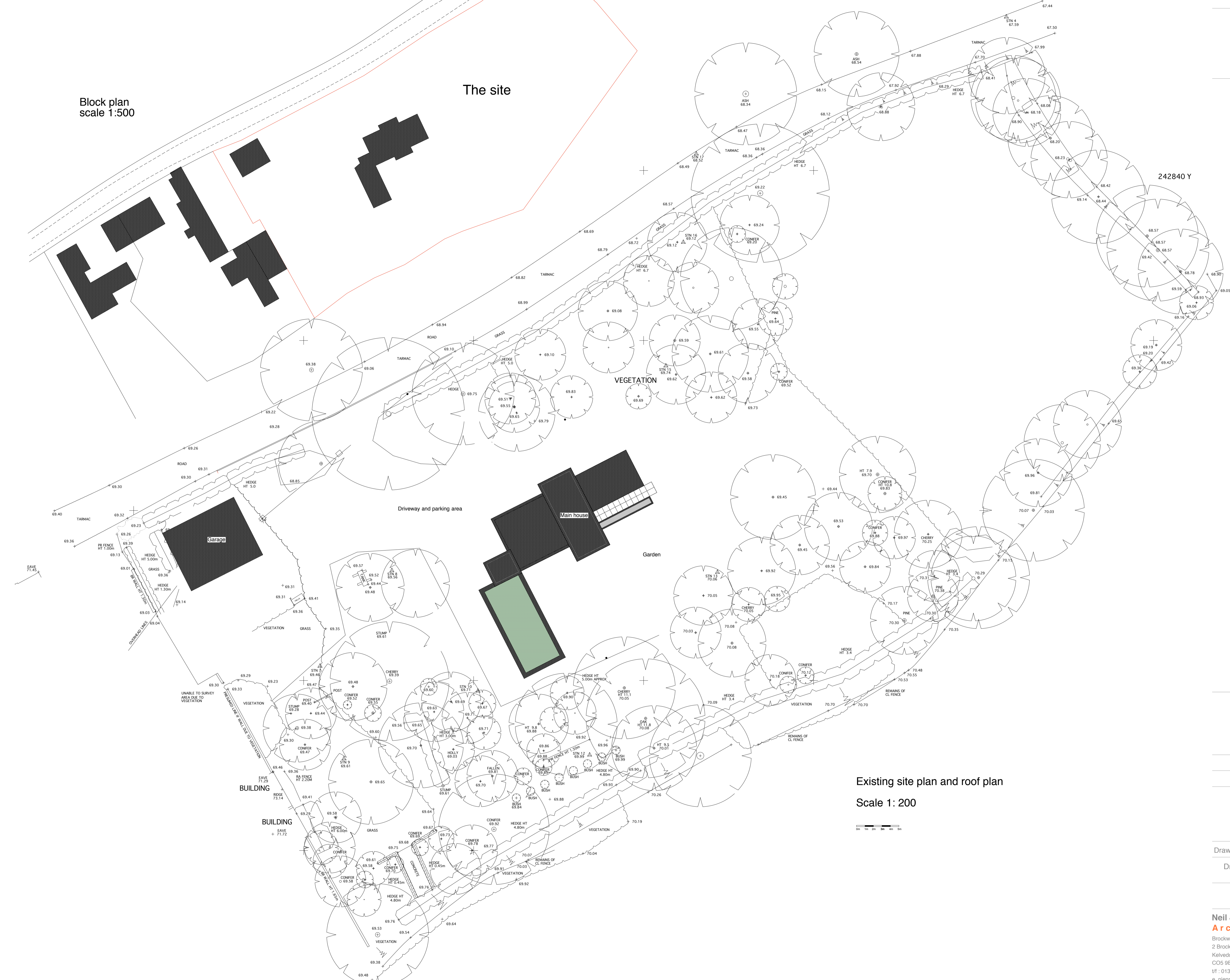
Existing site plan and roof plan