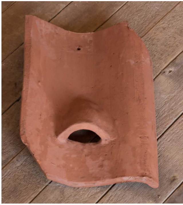
William Blyth Airvent Pantile