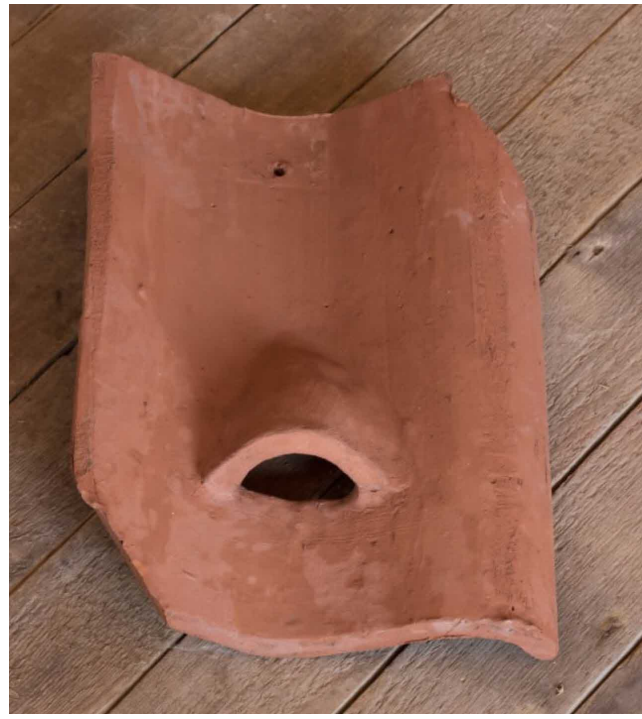
William Blyth Airvent Pantile