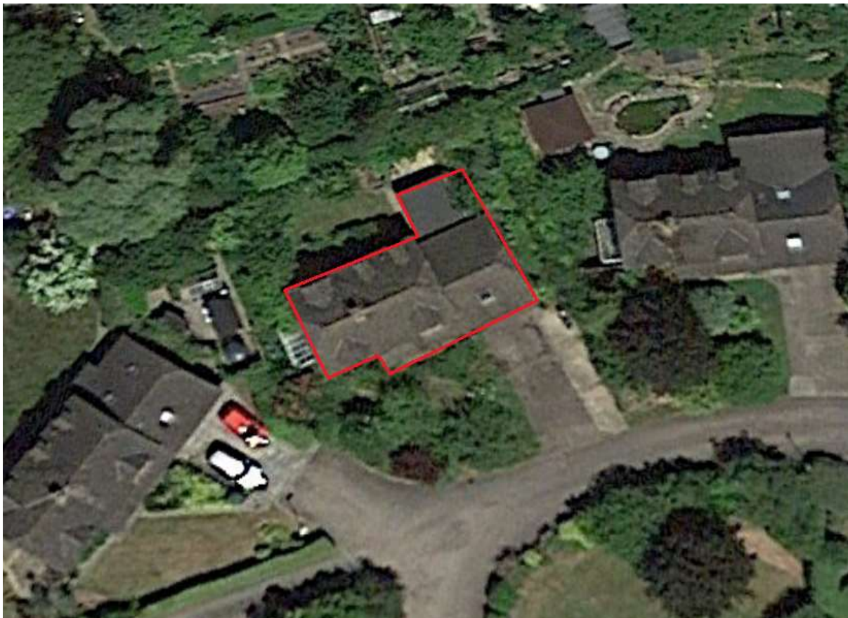
Figure 1. Location of the dwelling