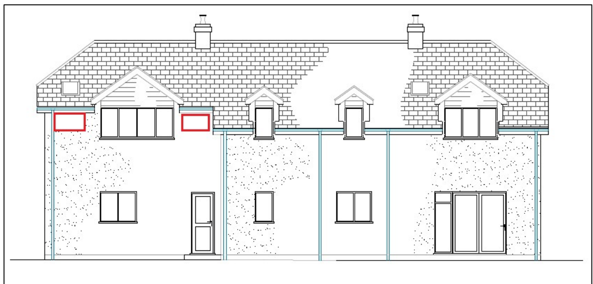
Figure 3. Proposed location of the bird boxes to the north elevation (red boxes).

Enhancement for nesting birds may comprise of 2 no. Vivara Pro Woodstone House Sparrow Nest Box (double chamber) 8 or equivalent. The boxes should be located as high as possible to the north elevation (Figure 3).