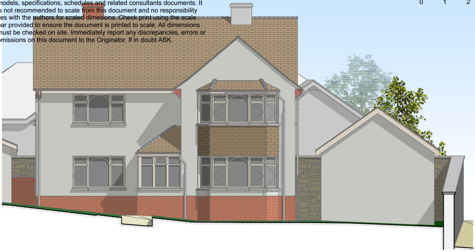
E-03 East Elevation Existing 1:100