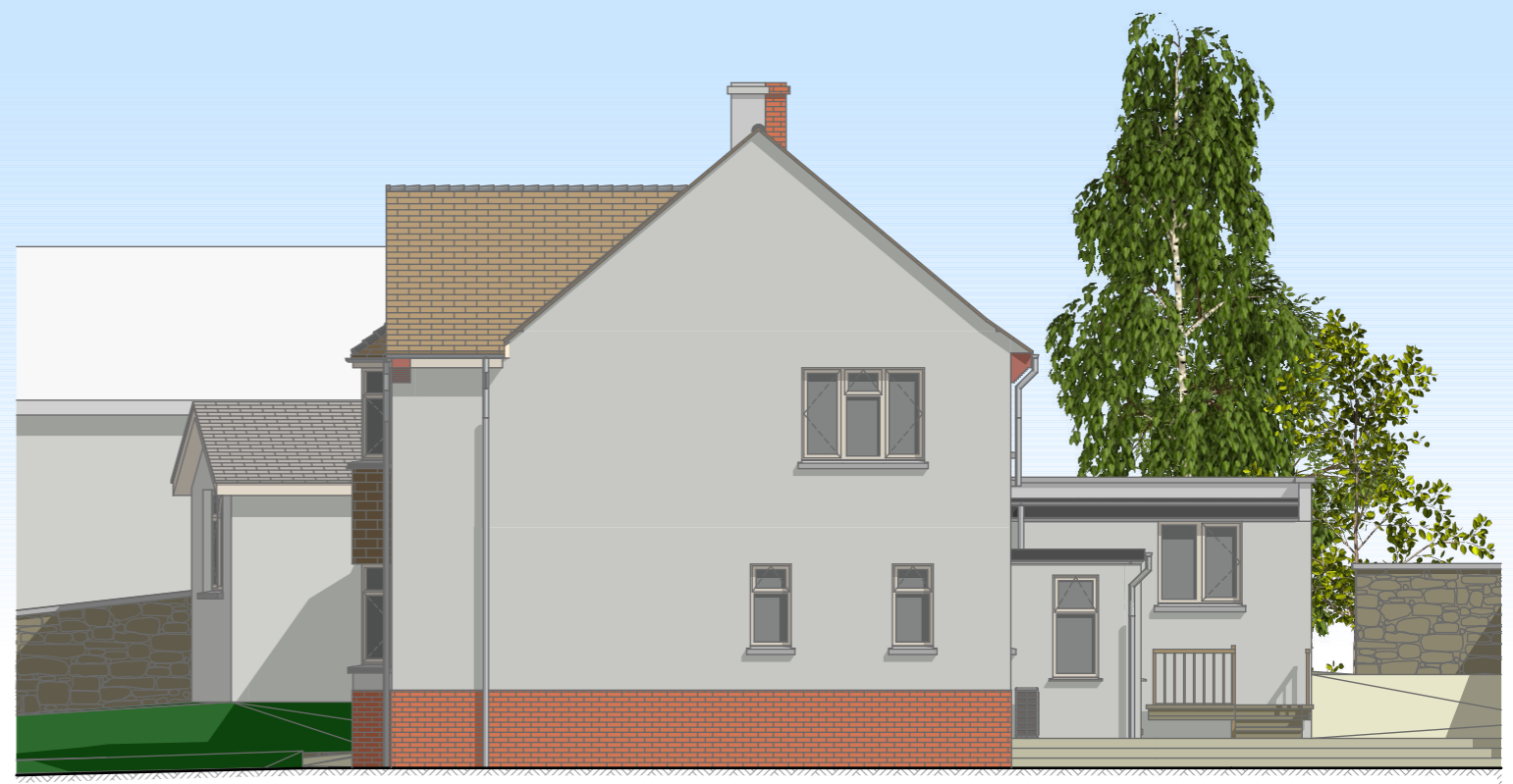
E-02 North Elevation Existing 1:100

Layout Title A3 Elevations Existing 1-100