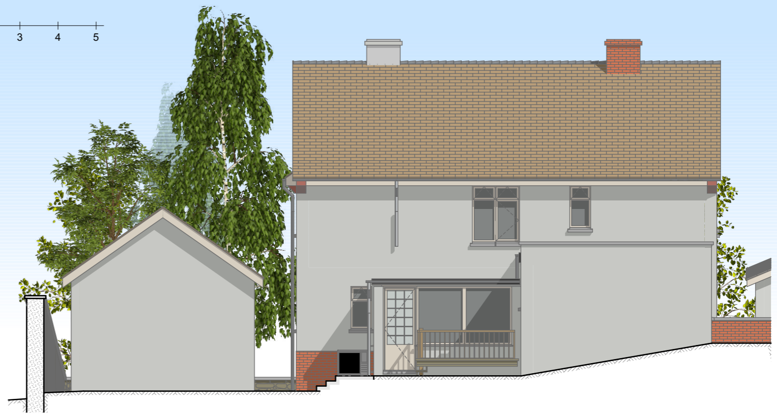
E-01 West Elevation Existing 1:100