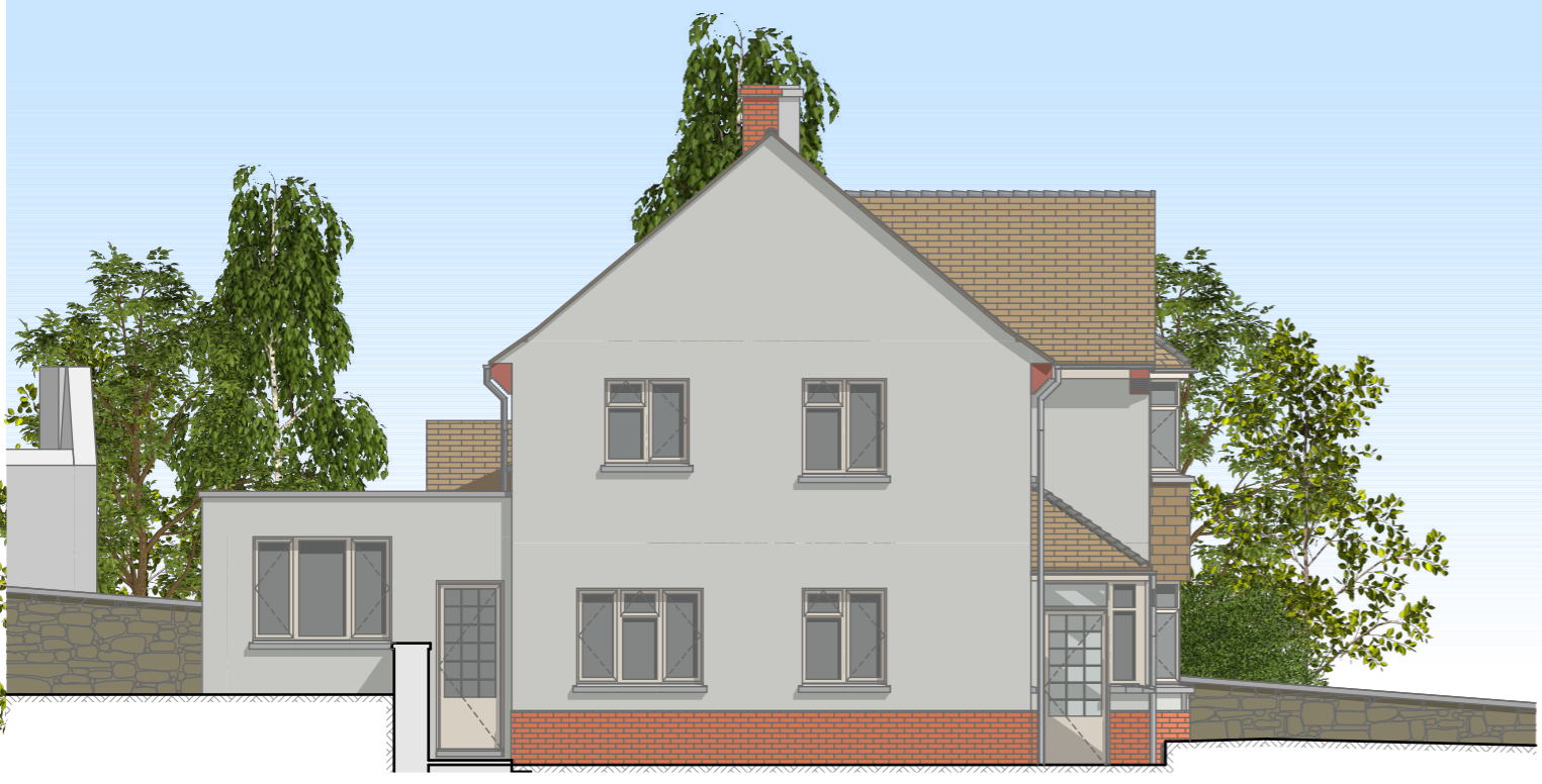
E-04 South Elevation Existing 1:100