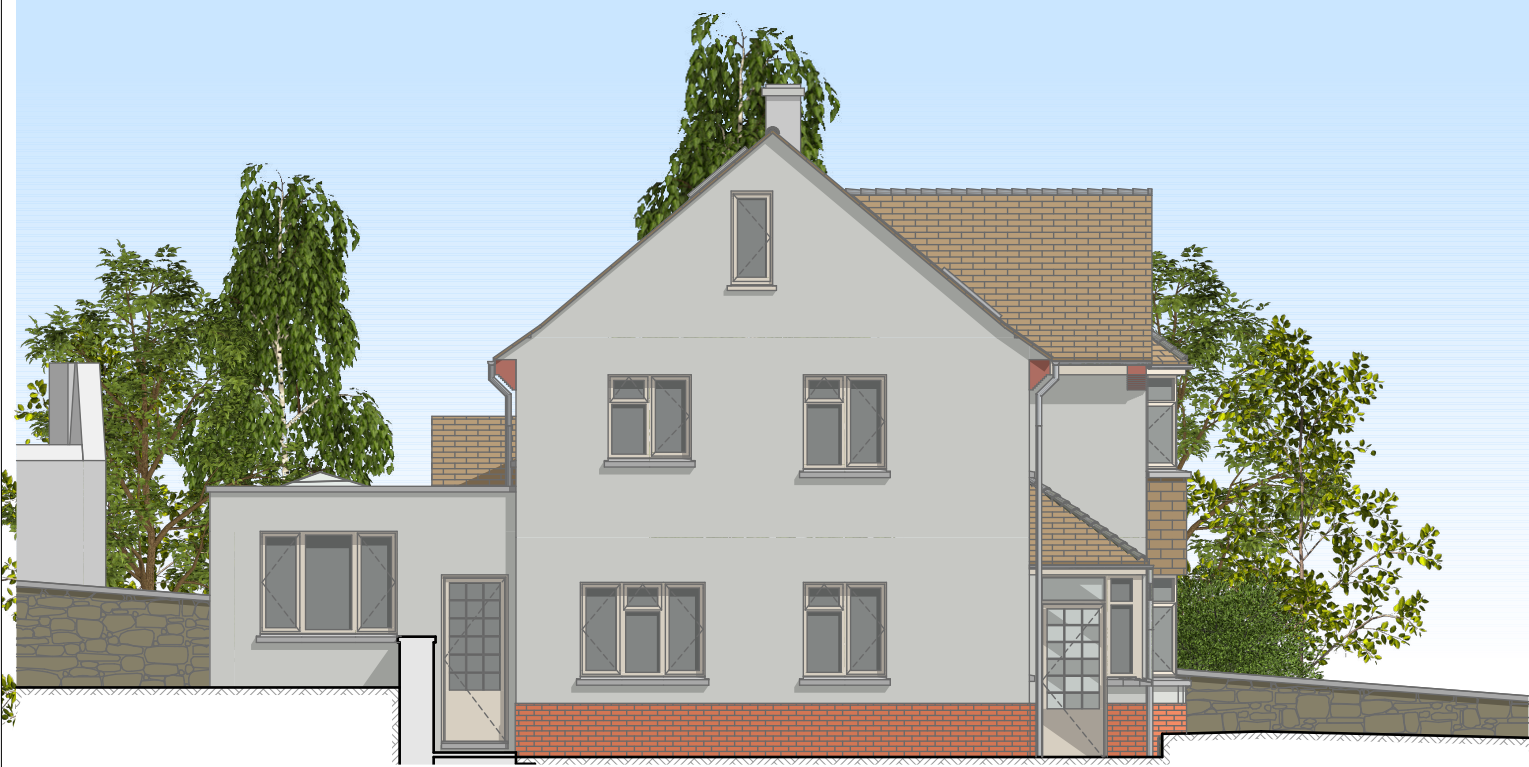
E-04 South Elevation Proposed 1:100