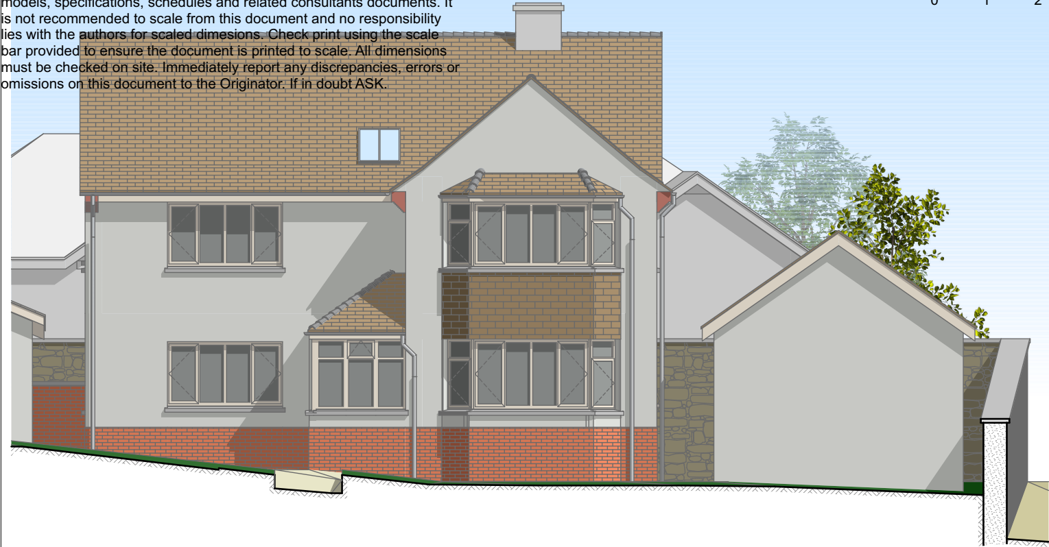
E-03 East Elevation Proposed 1:100