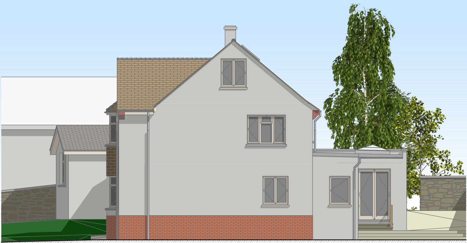
E-02 North Elevation Proposed 1:100

Layout Title A3 Elevations Proposed 1-100