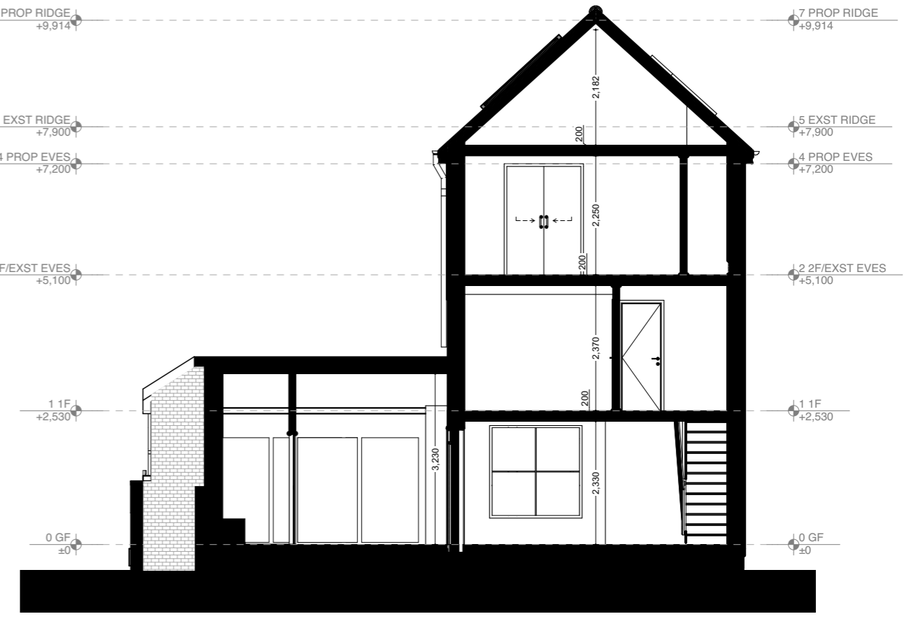
PROPOSED SECTION S-2