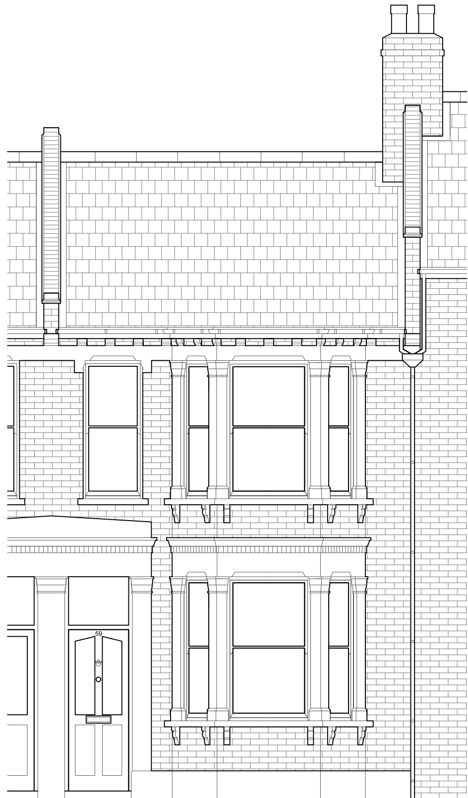
E EXISTING FRONT ELEVATION 01 SCALE 1/50