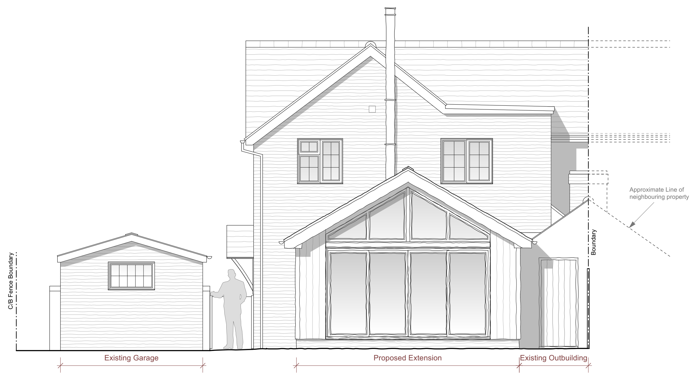
Proposed Rear Elevation Scale 1:50 @ A1