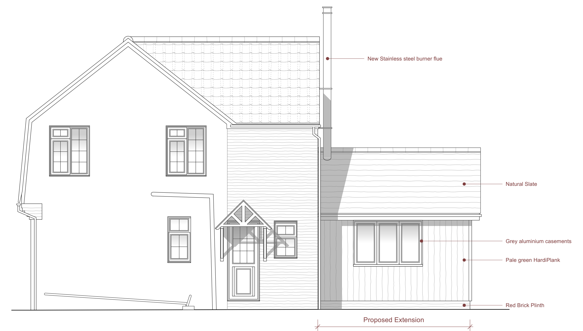
Proposed Side Elevation Scale 1:50 @ A1

Contractor is responsible for all setting out and must check dimensions on site before work is put in hand. Written dimensions only to be taken, this drawing must not be scaled. JAP Architects to be immediately notified of suspected omissions or discrepancies ©