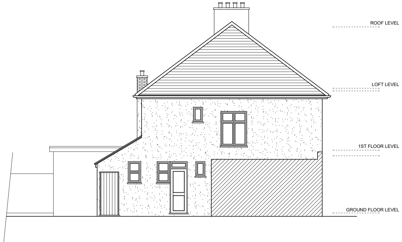
Flank Elevation as Existing