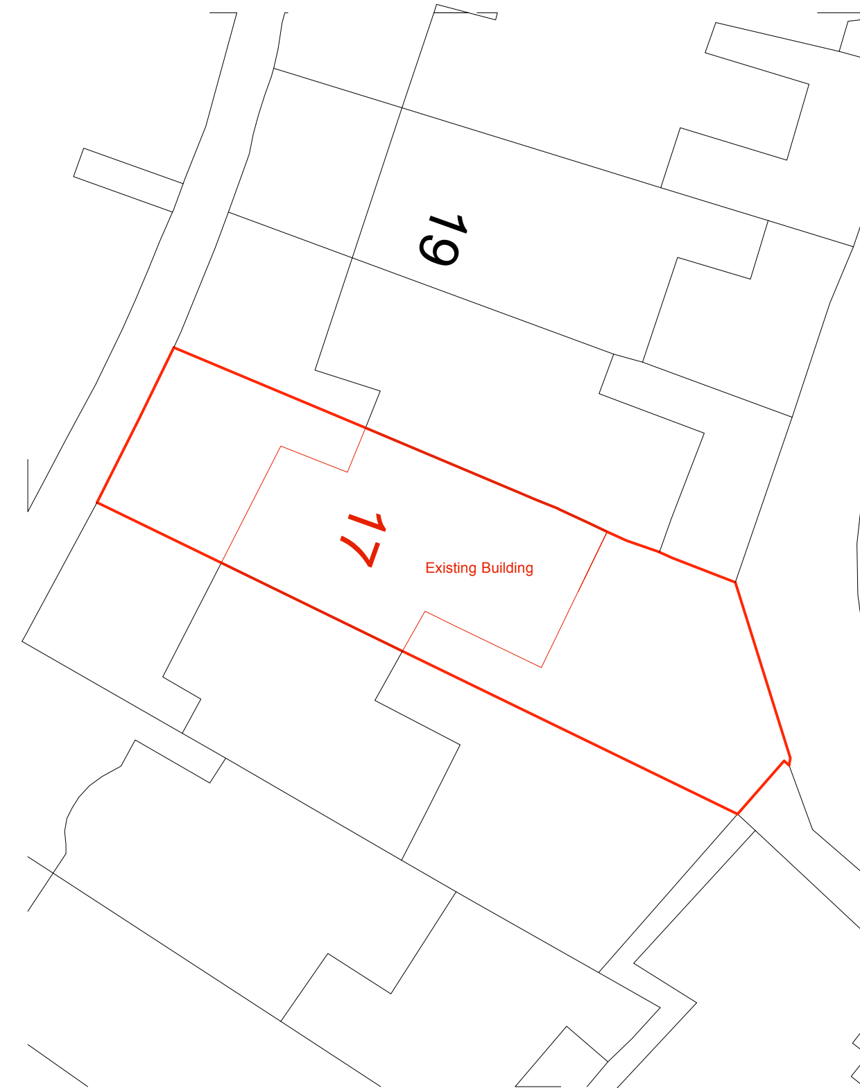
Block Plan Showing Existing Building and demise Scale 1:200 @ A3