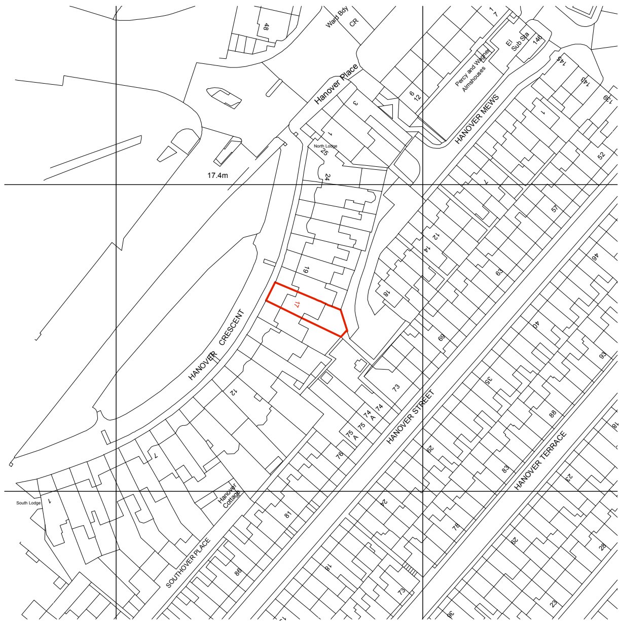
Location Plan Scale 1:1250 @ A3