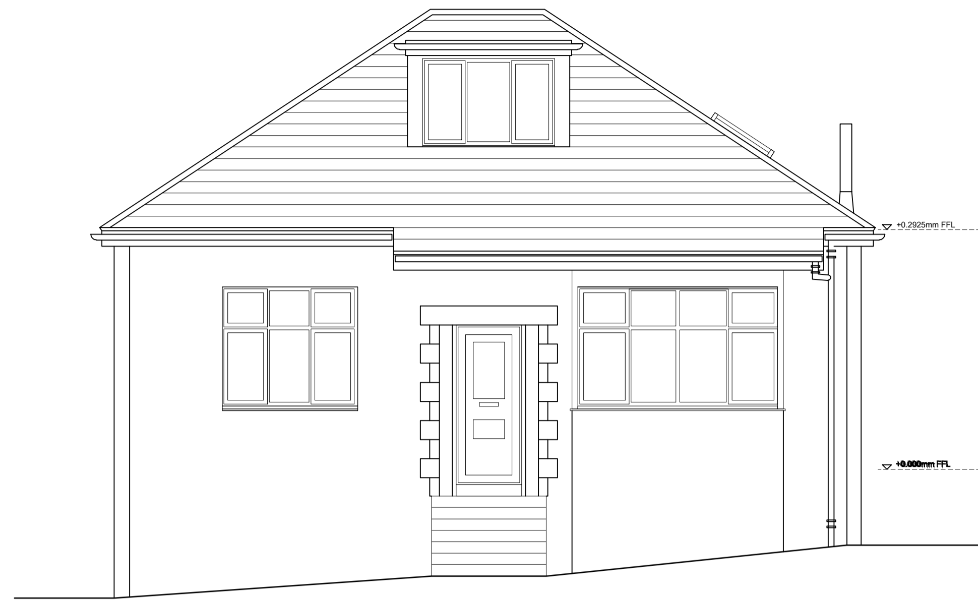
Existing Front / South Elevation Sx