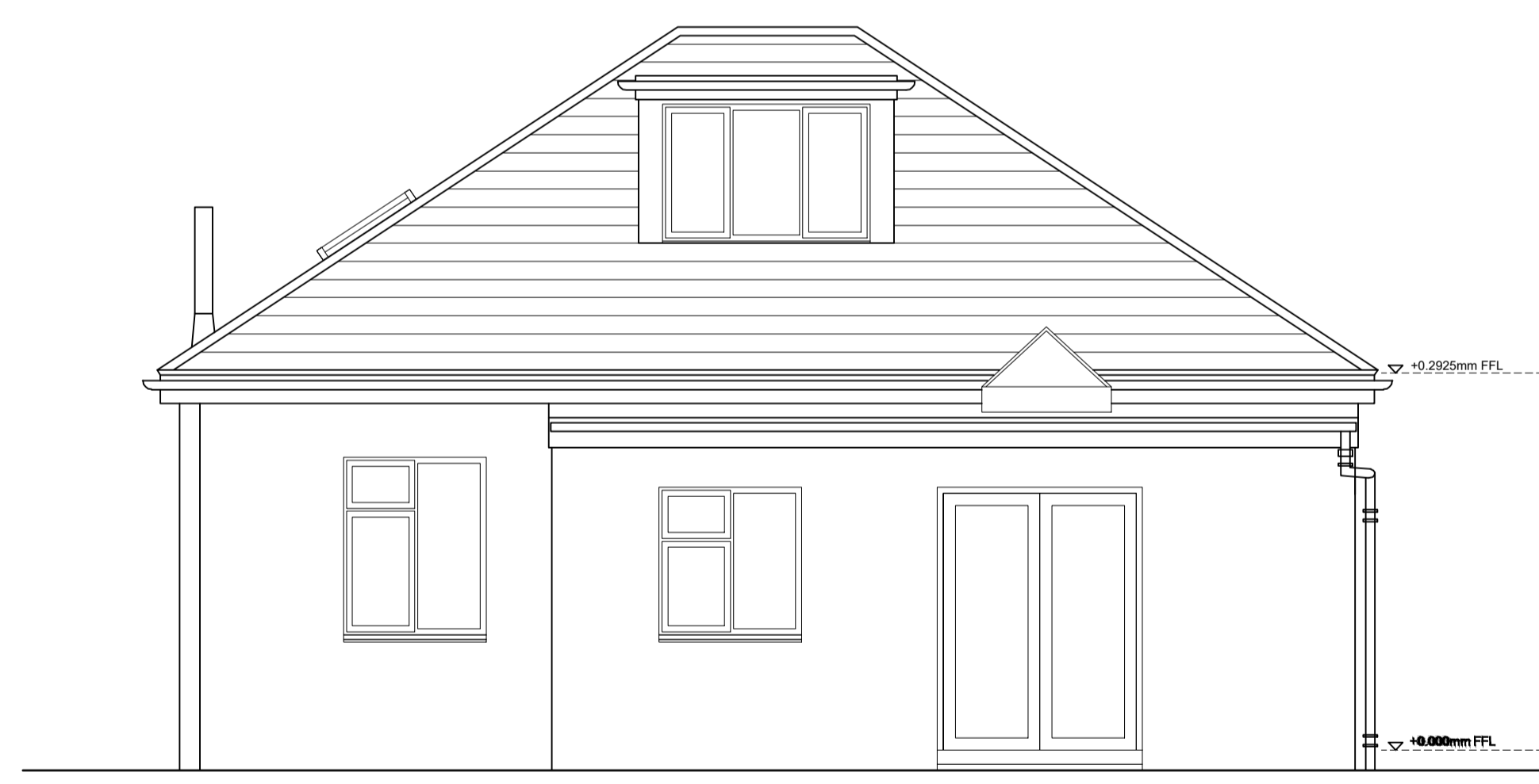
Existing Rear / North Elevation Nx