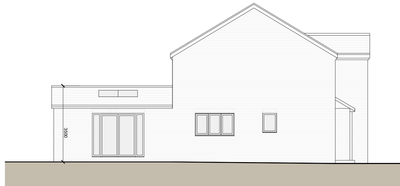
Side Elevation (north)