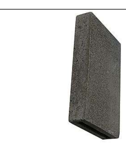
Photograph 15. Greenwood's EcoHabitats single cavity bat box