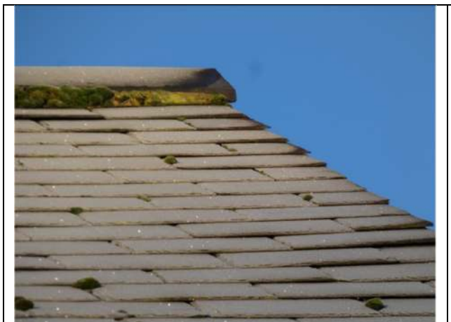
Photograph 5. Further example of the roof slates