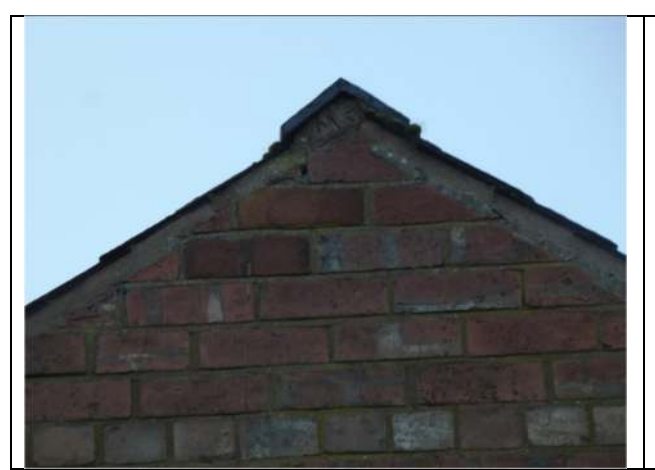
Photograph 7. Example of sealed roof edge on north gable wall