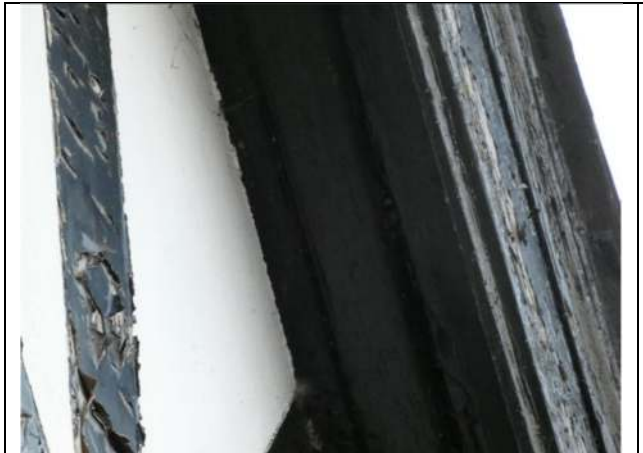
Photograph 9. Example of sealed barge board area on west gable wall