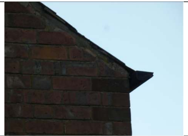
Photograph 8. Further example of sealed roof edge on north gable wall