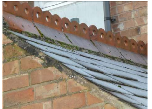
Photograph 6. Example of the slates on the roof of the single-storey rear projection