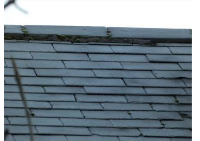
Photograph 4. Example of the roof slates