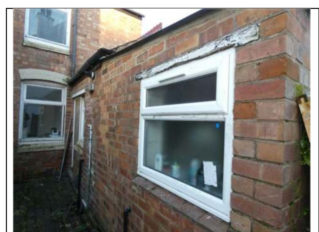
Photograph 11. The sealed south edge of the singlestorey rear projection