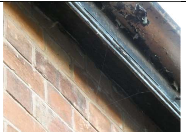
Photograph 10. Example of saled wooden fascia and soffit