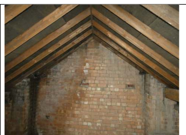
Photograph 12. The enclosed roof void