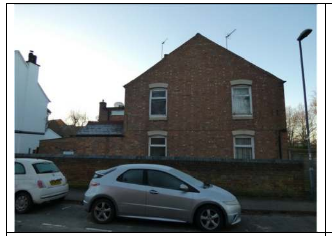
Photograph 3. The north elevation