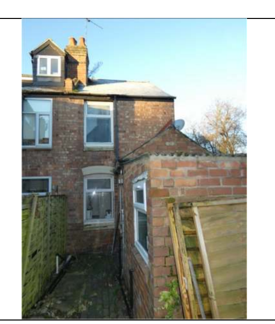
Photograph 2. The east elevation