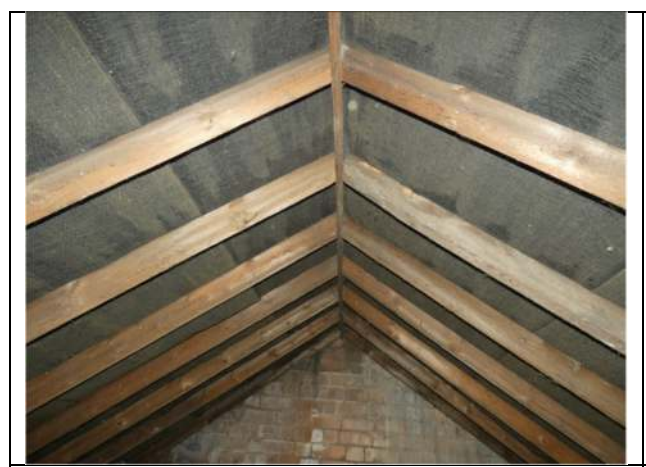
Photograph 13. The ridge area wihitn the enclosed roof