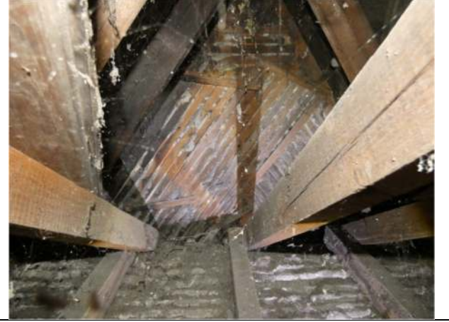
Photograph 14. The area within the roof void in the west dormer gable