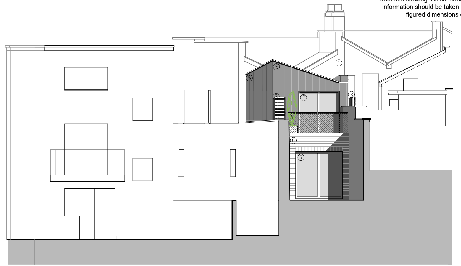
Proposed Rear Elevation 1:100