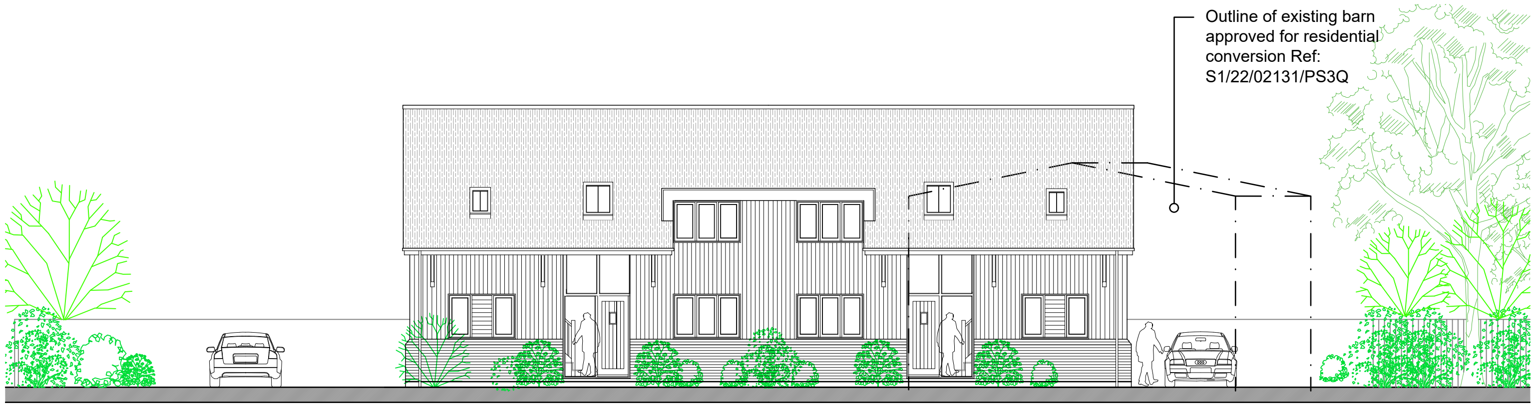
elevational site section across frontage