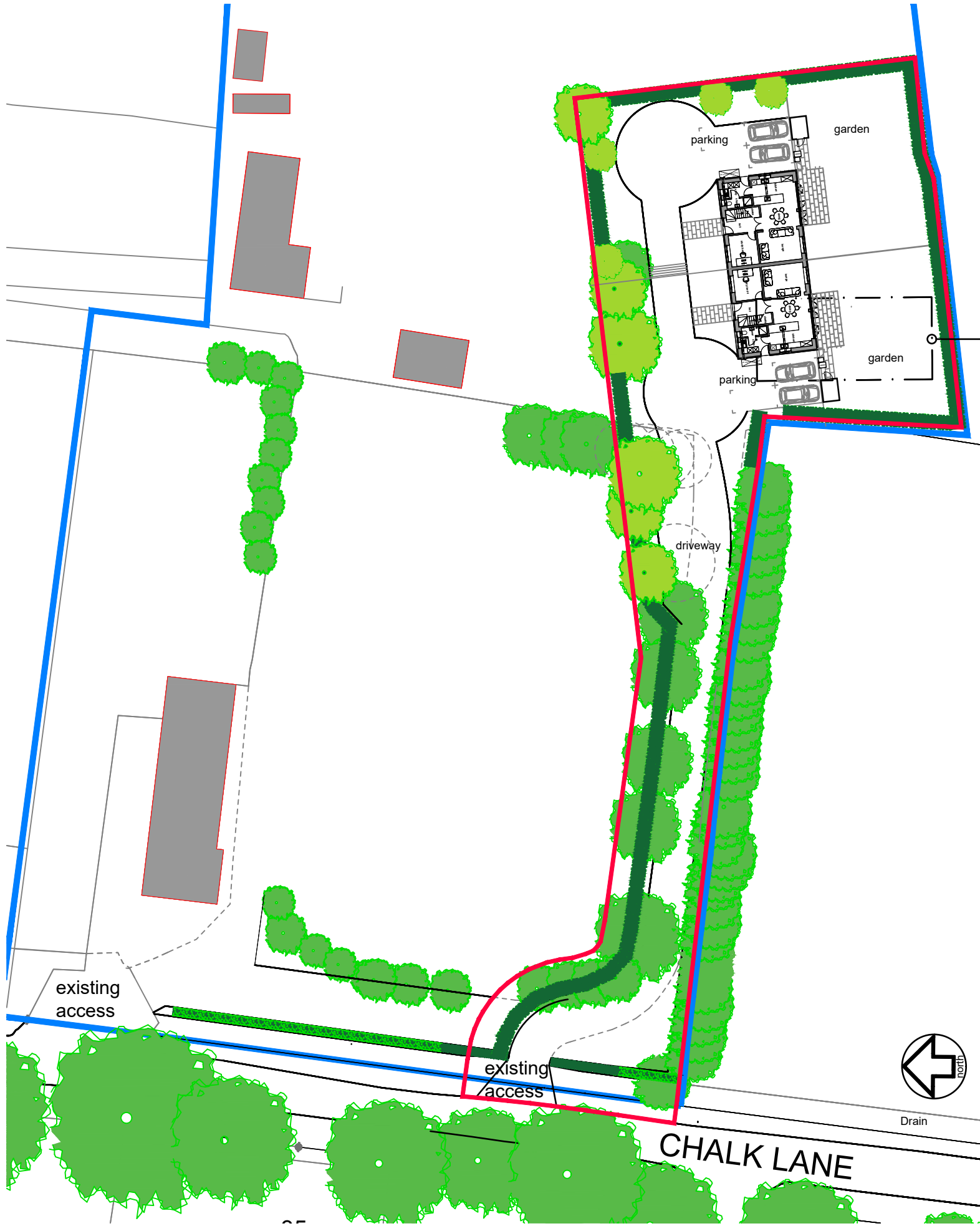
proposed site plan 1:500 proposed site plan