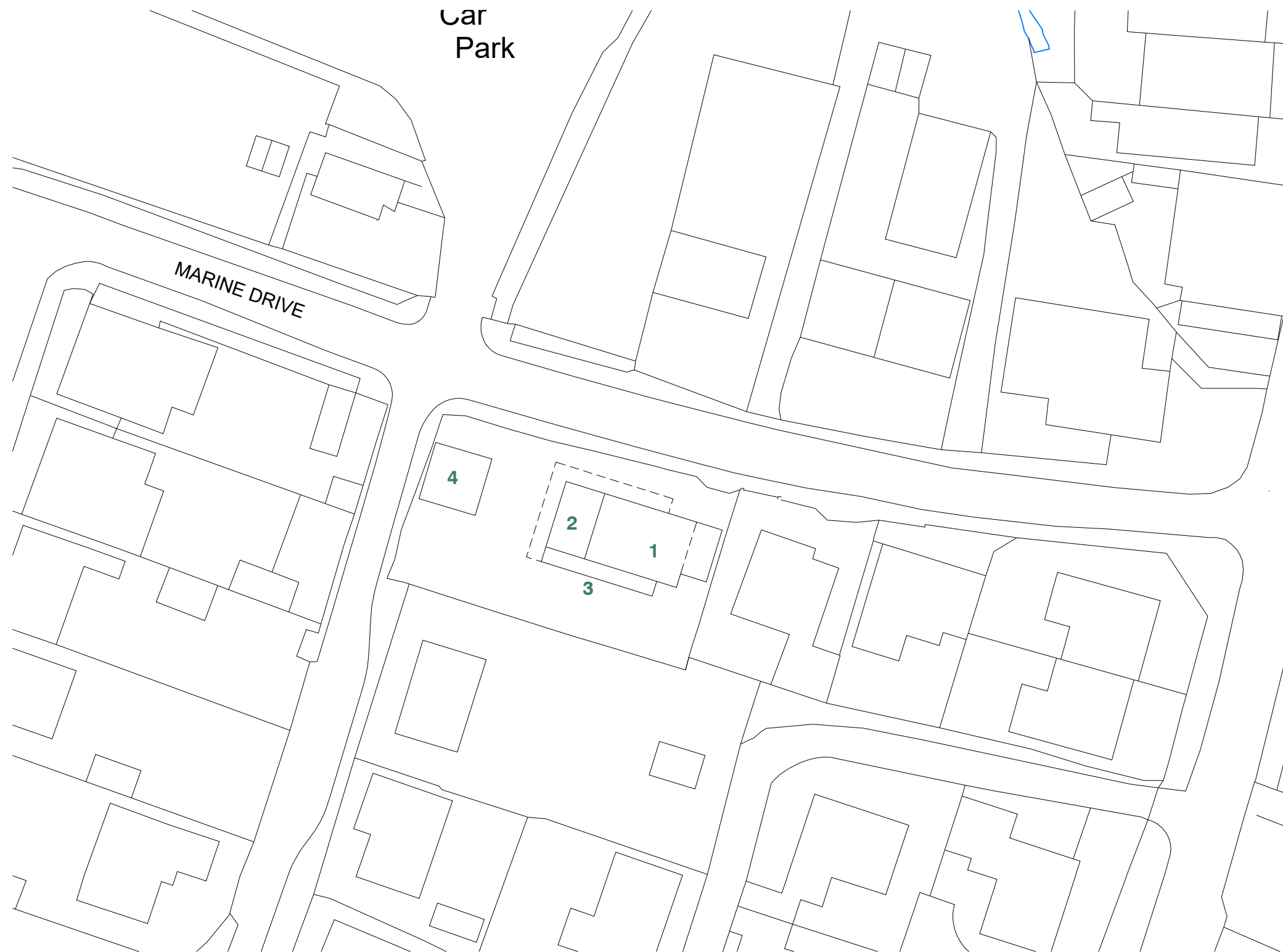
BLOCK PLAN SCALE 1:500 @ a3