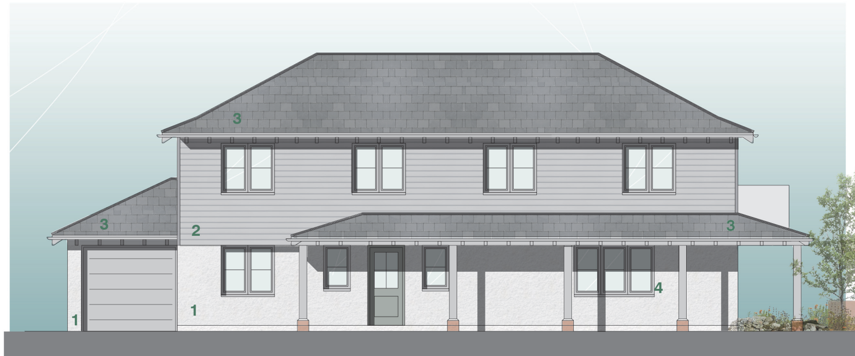
PROPOSED NORTH ELEVATION SCALE 1:100 @ a3