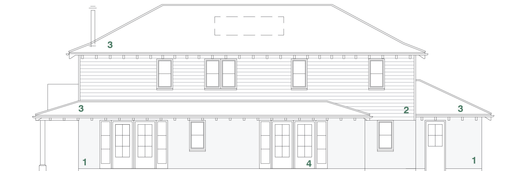
PROPOSED SOUTH ELEVATION SCALE 1:100 @ a3