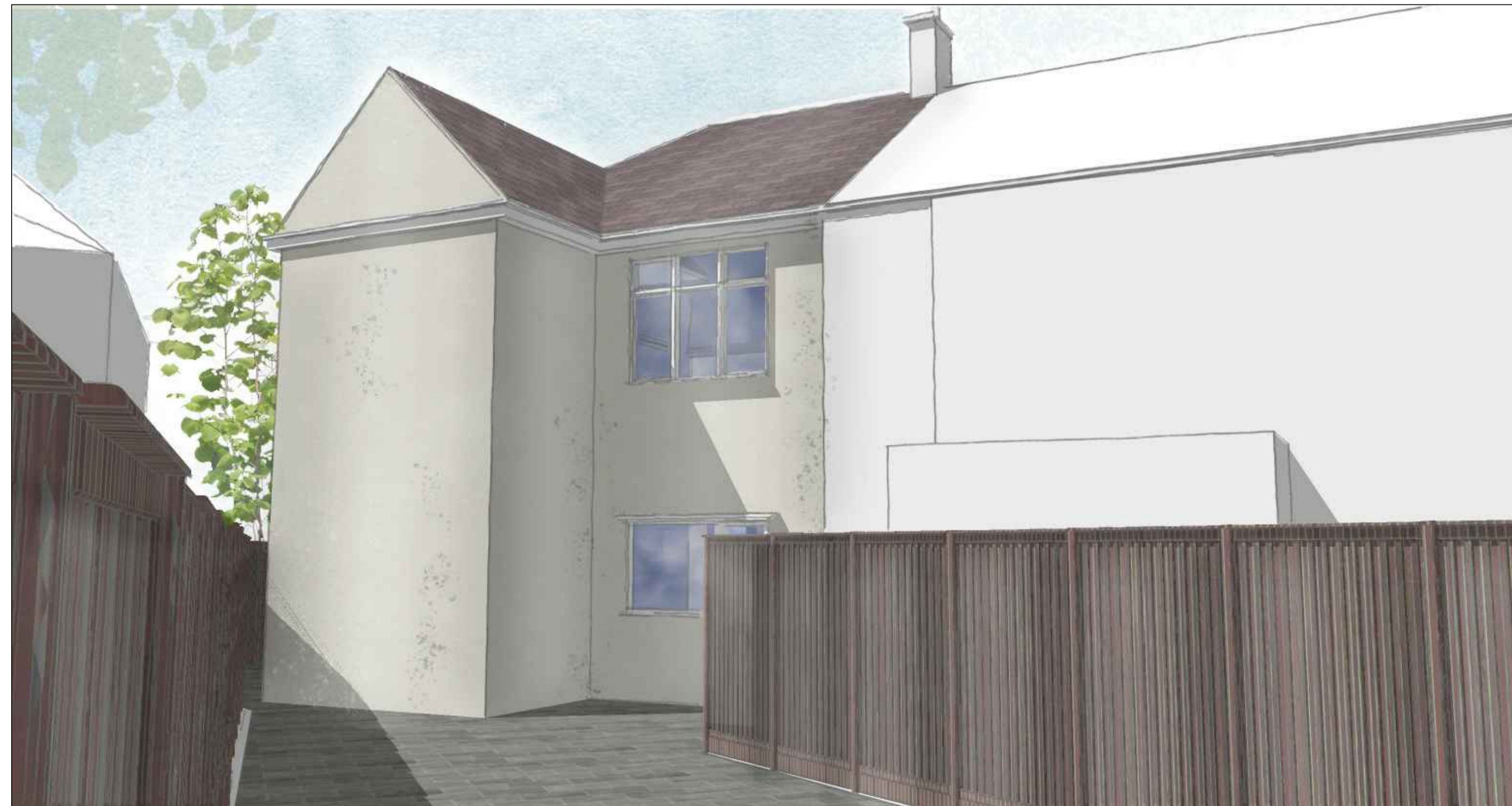
PROPOSED REAR VISUAL