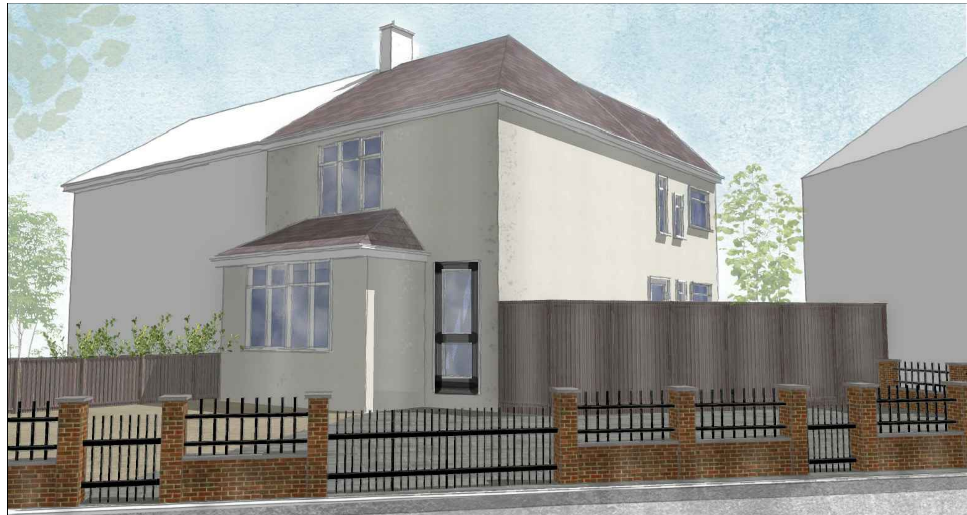
PROPOSED FRONT VISUAL