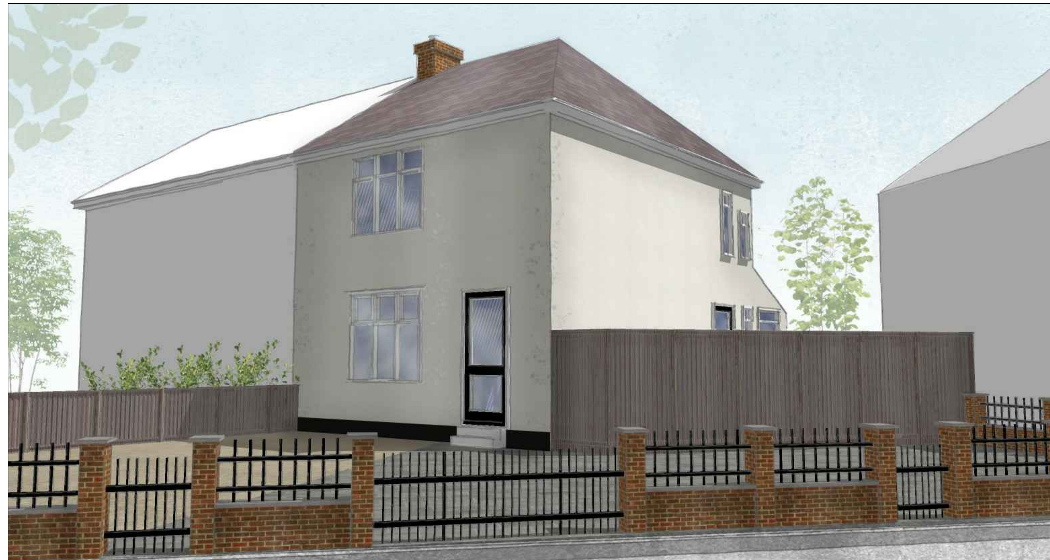
EXISTING FRONT VISUAL