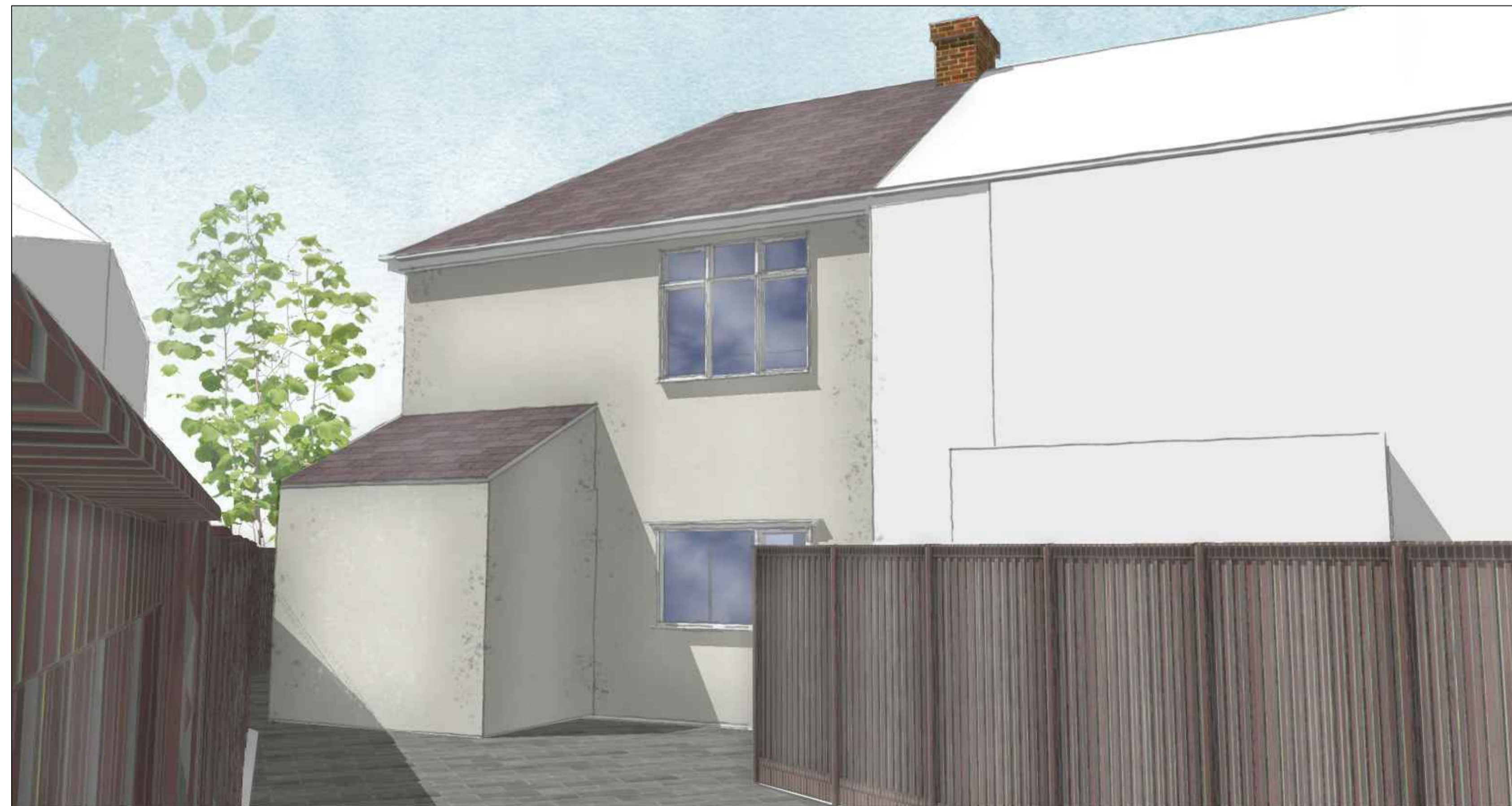
EXISTING REAR VISUAL