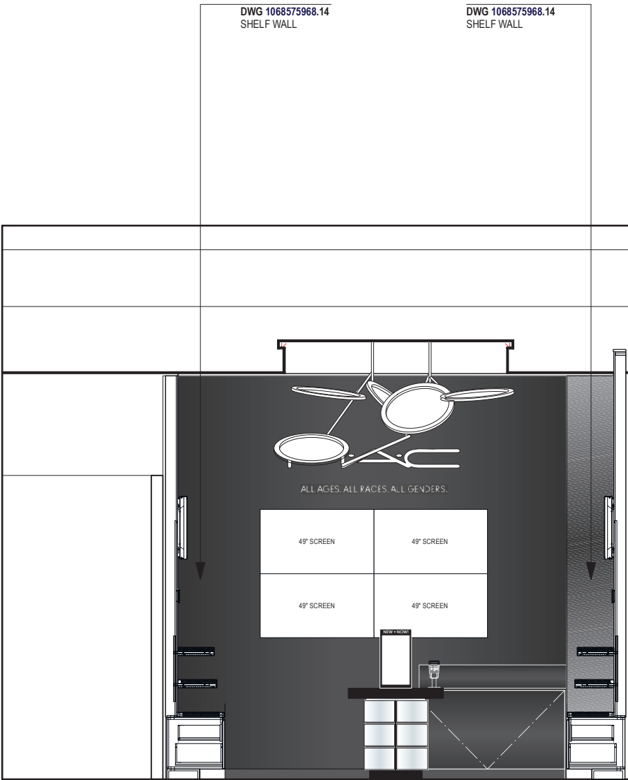
1 Elevation C-C Scale: 1:50@A3