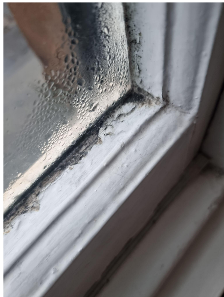
All of the above photos show the persistent issue with condensation throughout the property.